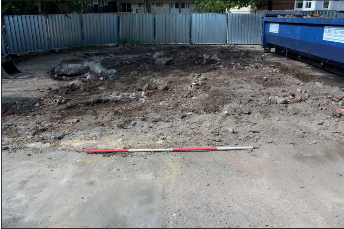
Post excavation photograph (2m scale)