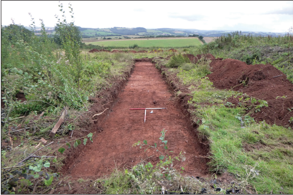
Trench 5, looking south (1m scales)