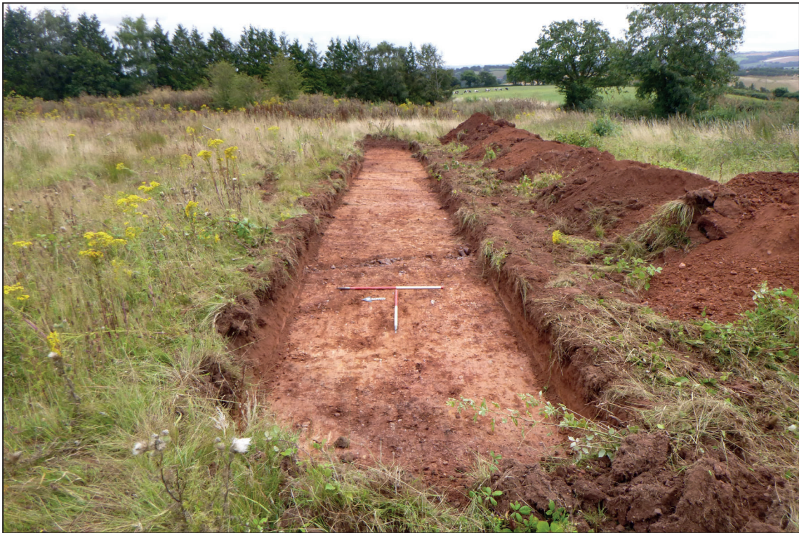
Trench 6, looking south-east (1m scales)