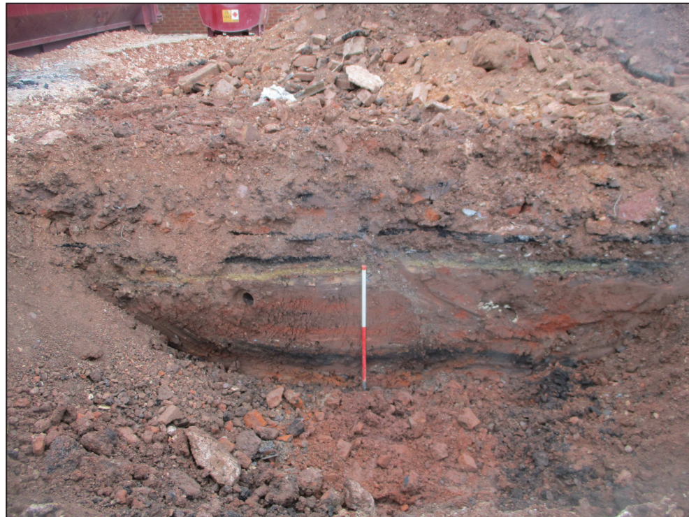
Trench 1, looking north-west (1m scale)