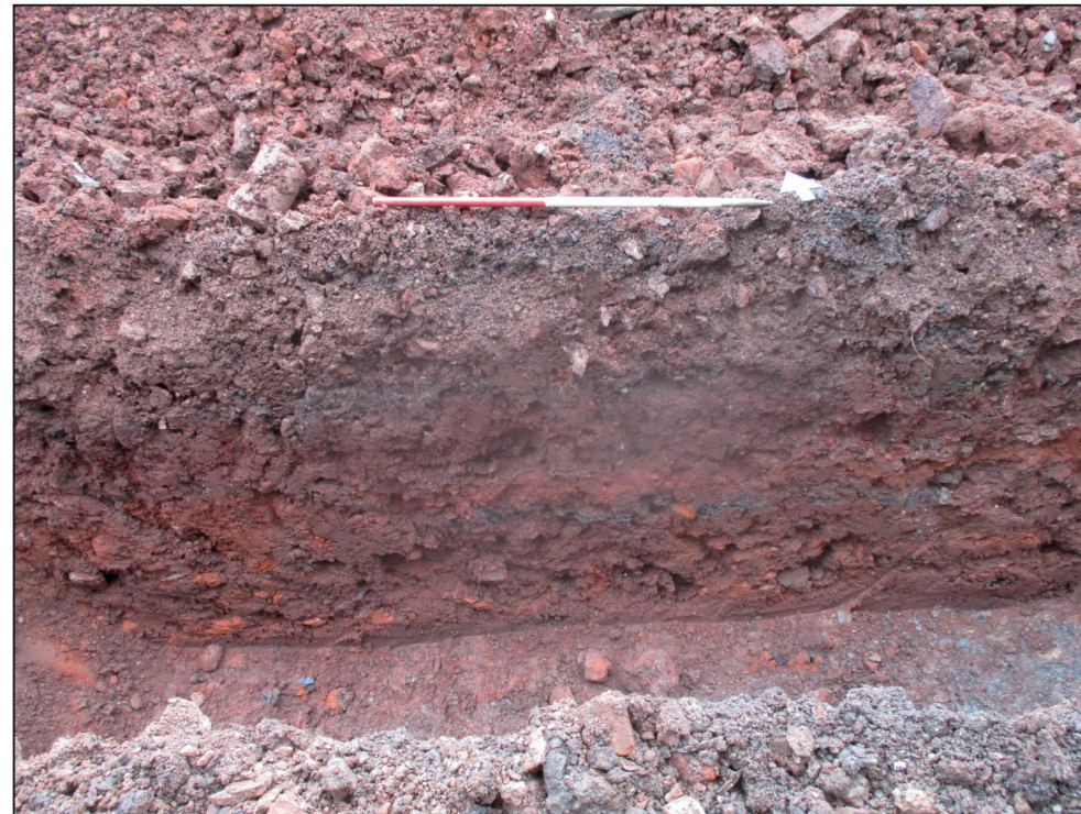
Trench 3, looking north-west (1m scale)