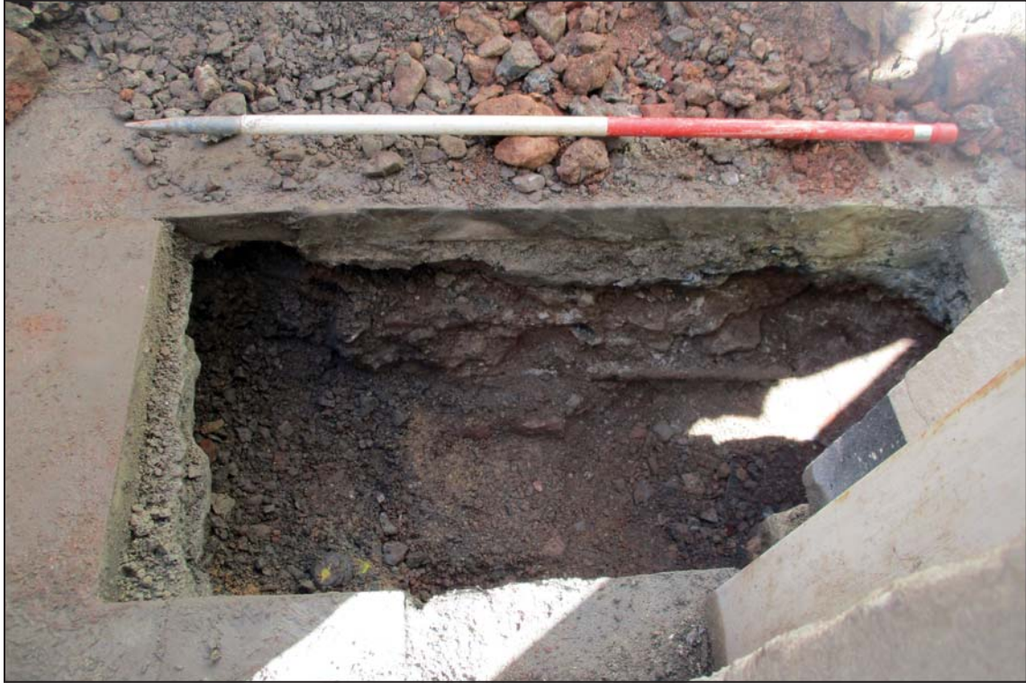
Excavated trench, looking south-west (scale 1m)