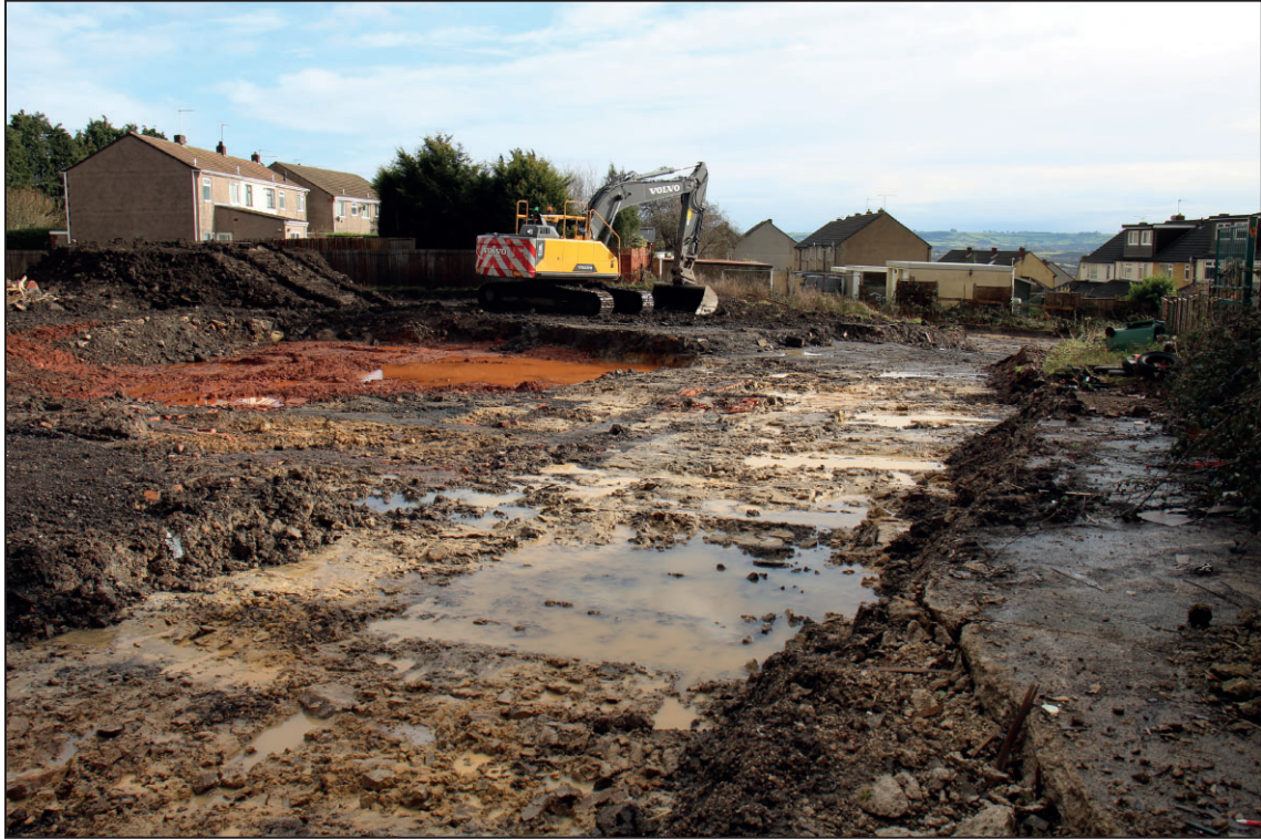
The site during groundworks, looking east