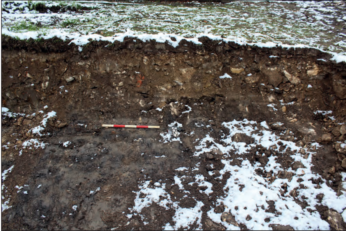
Modern deposit 103 section, looking north (scale 0.5m)