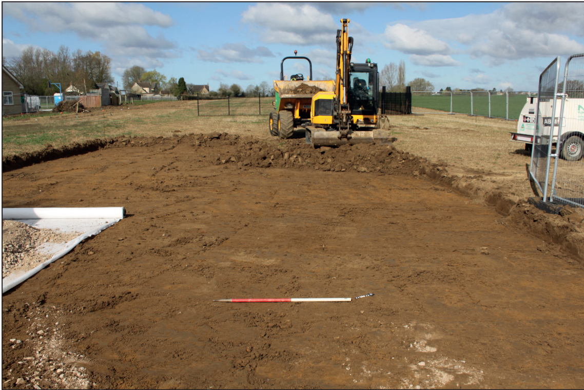
Area 1 overview, looking north-west (scale 1m)