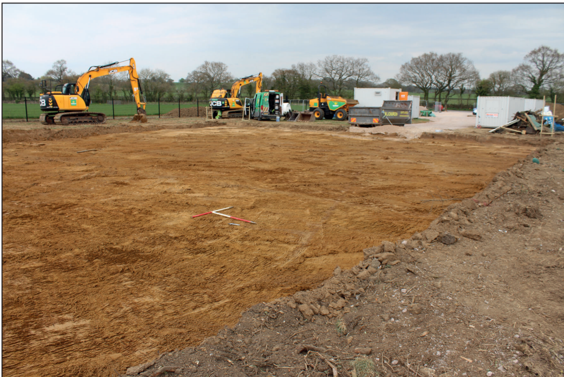
Area 2 overview, looking north-east (scales 1m)