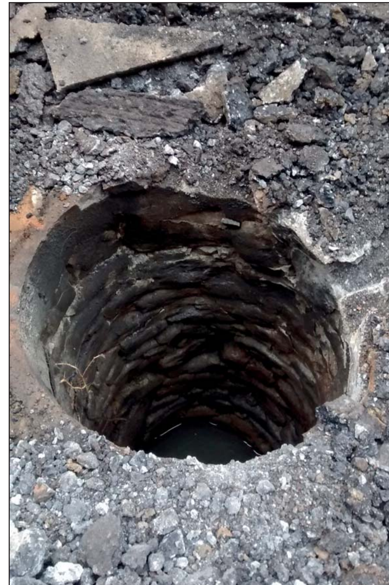
Well, looking north