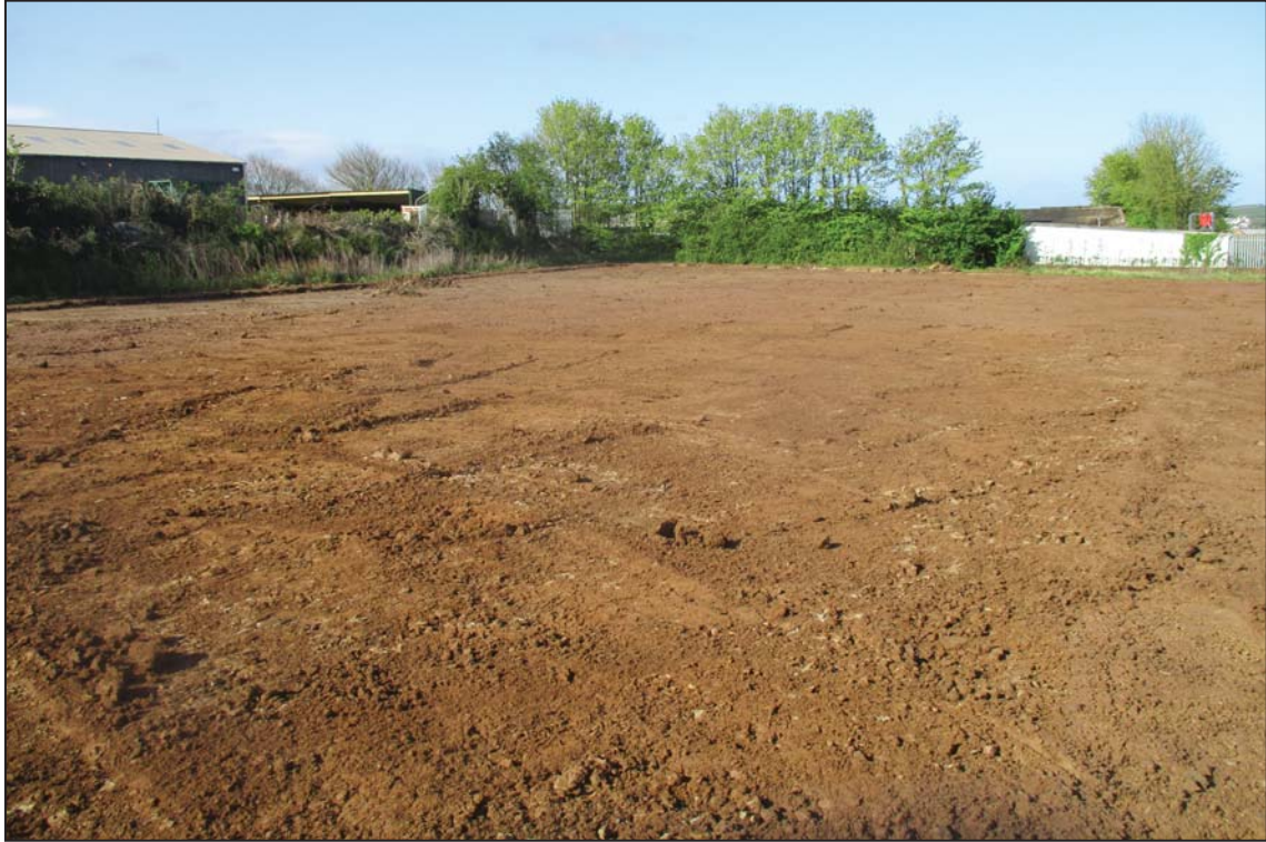
Site, after stripping