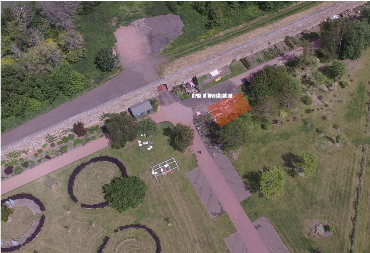
Plate 2 Aerial view of investigation area to east of walled garden.