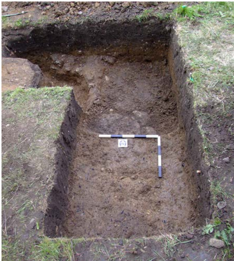
Plate 3: CP2 subsoils

4.2.2 Other than topsoil and subsoil, no layers were recorded. The topsoil was up to 300mm deep with light brown subsoil beneath – silty clay. The topsoil was charcoal rich and was evidence of the ploughing that took place in the 2 nd world war (given the depth). The subsoil contained some larger sub angular stones relating to the underlying geology of glacial till.