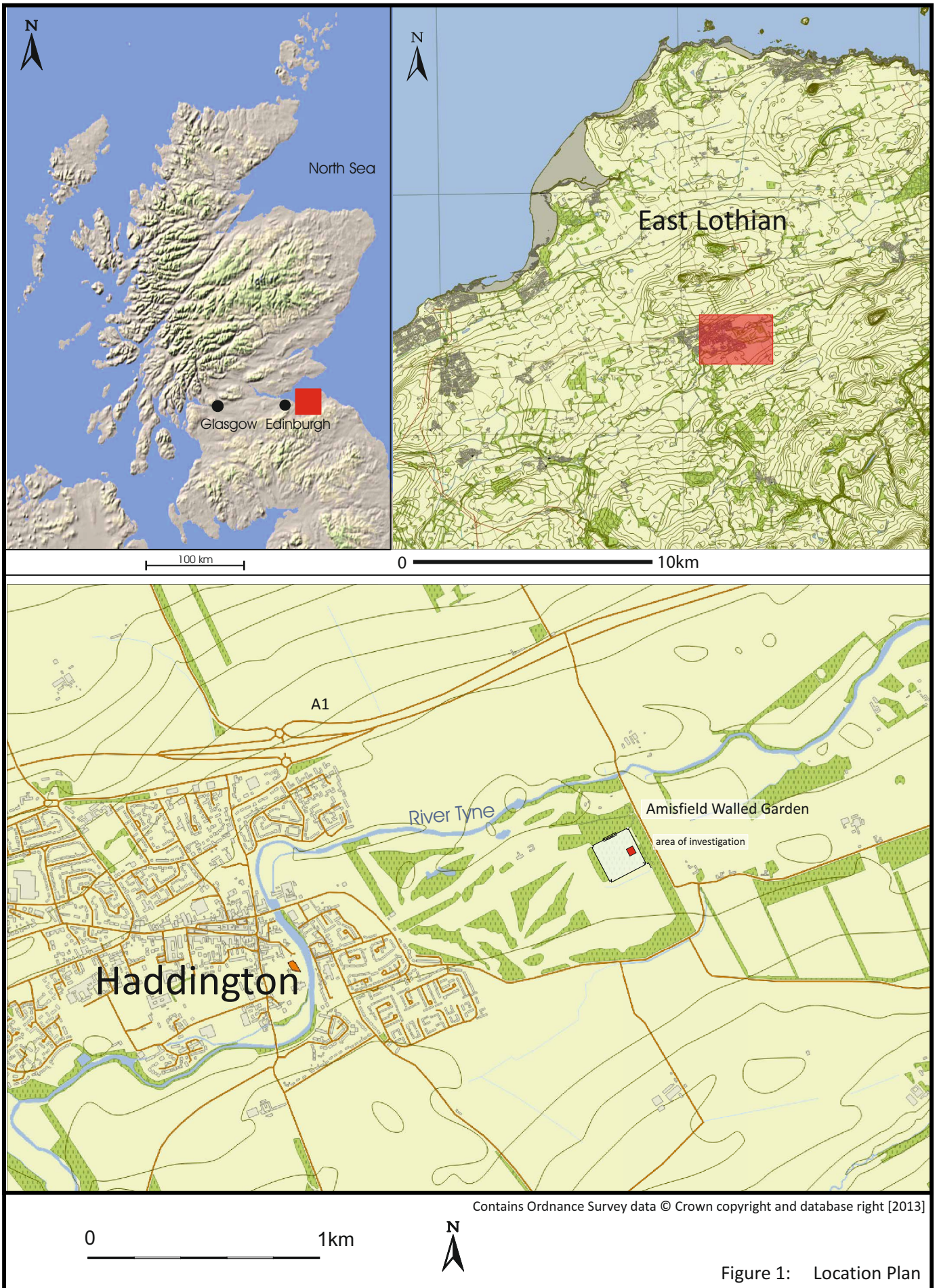
Figure 1: Location Plan