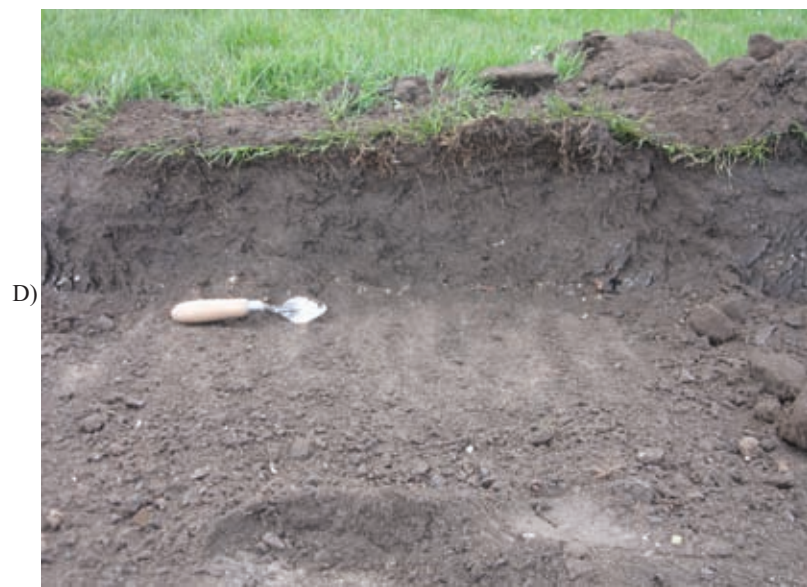
Figure 2. Views of the watching brief A) Machine stripping in progress, facing north B) View of stripped areas, facing southwest C) Gravel filled modern drain, facing southeast D) Section through stripped deposits, facing southeast D) Section through stripped deposits, facing northwest.