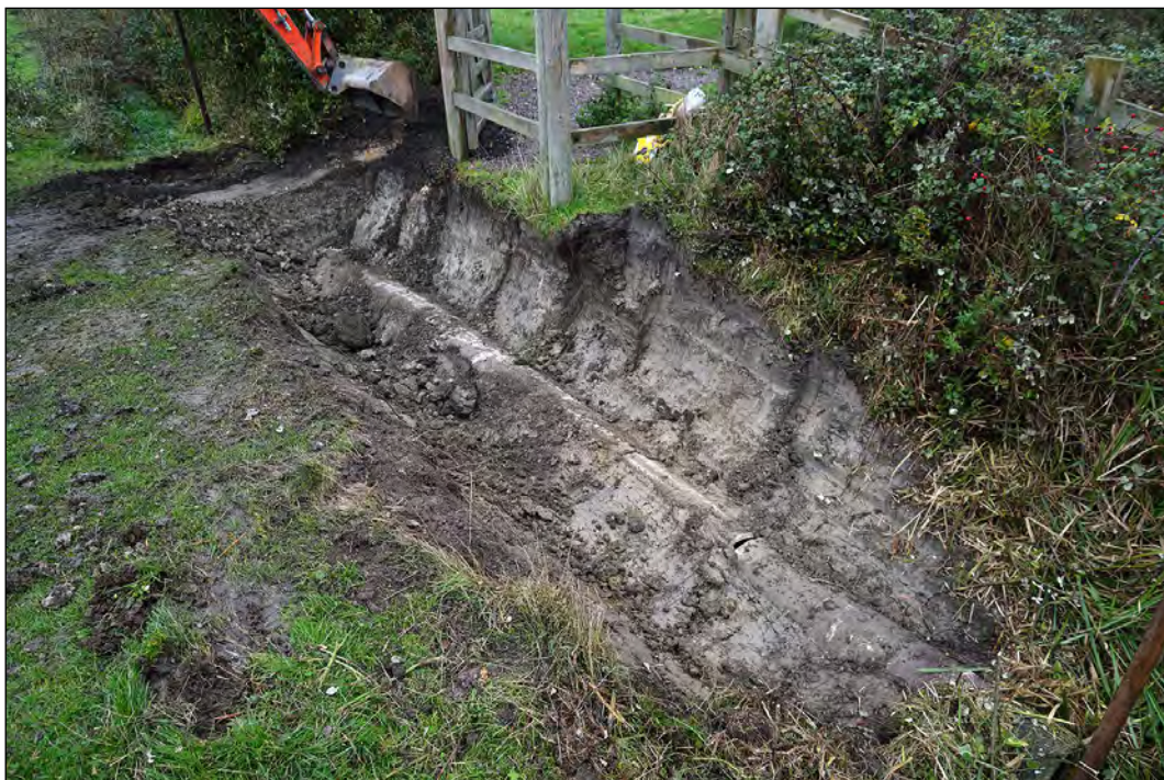
Figure 1: Location of observations and photograph of works underway