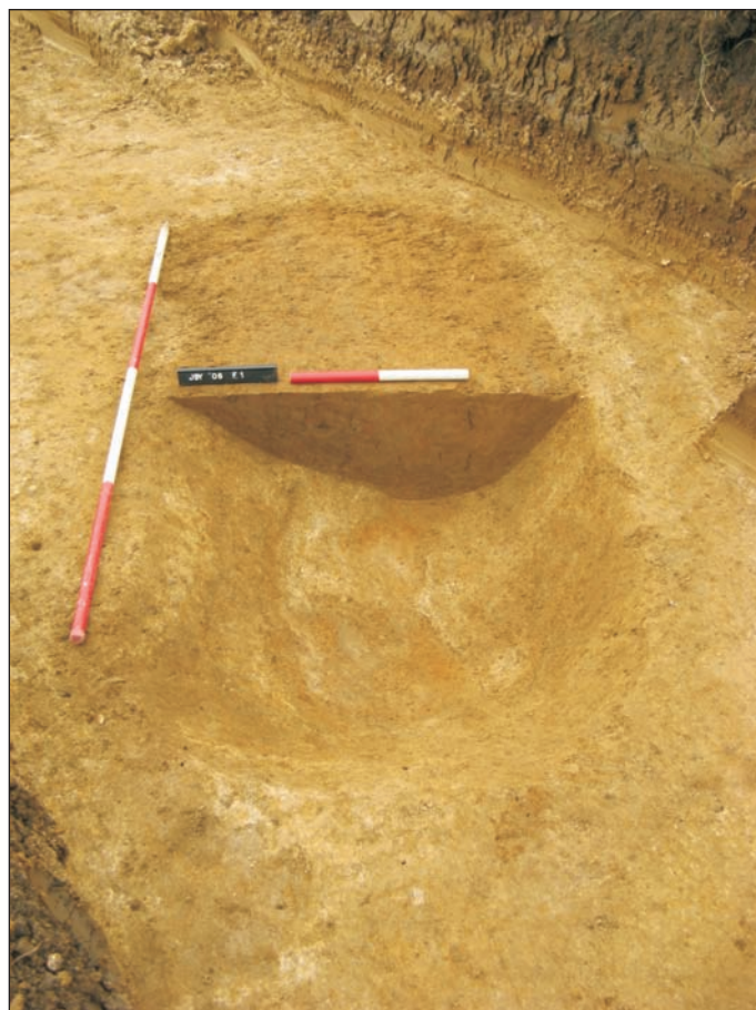
Figure 3. Plan and photo of Feature 1