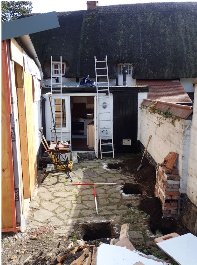
Fig. 2 - Photo of foundation pads for extension in rear yard of property, from the W