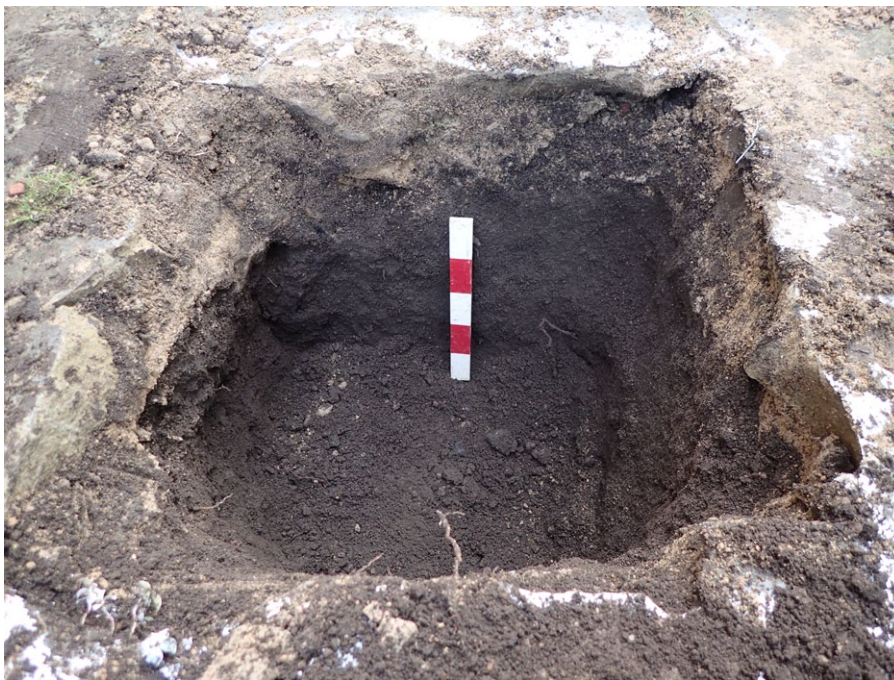
Fig. 3 - Shot of Pad 1 excavated to final depth through topsoil 0102, from the W

Project: 1 Forge Cottages, Malthouse Lane, Dorchester-on-Thames: Archaeological Watching Brief