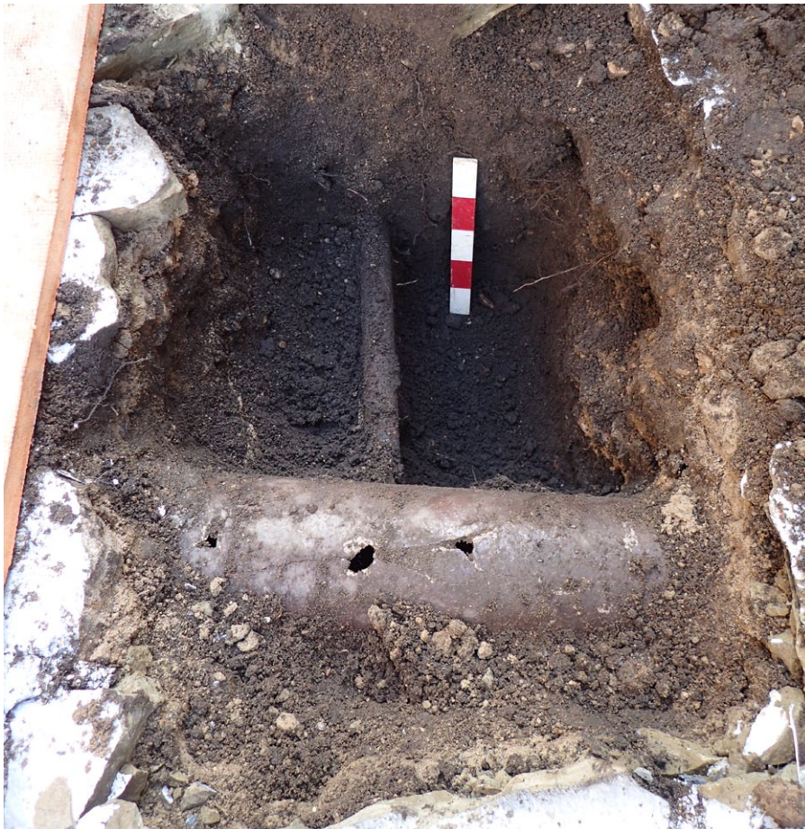
Fig. 5 - Shot of Pad 3 showing waste water service and steel pipe cut into topsoil layer 0302, from the W

Project: 1 Forge Cottages, Malthouse Lane, Dorchester-on-Thames: Archaeological Watching Brief