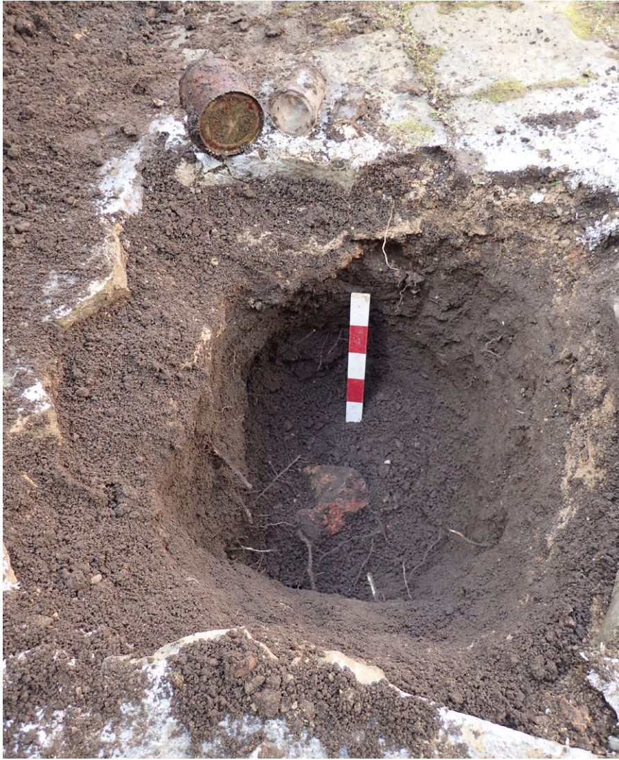
Fig. 6 - Shot of Pad 4 excavated to final depth through topsoil 0402 and into rubbish layer 0403, from the E

Project: 1 Forge Cottages, Malthouse Lane, Dorchester-on-Thames: Archaeological Watching Brief