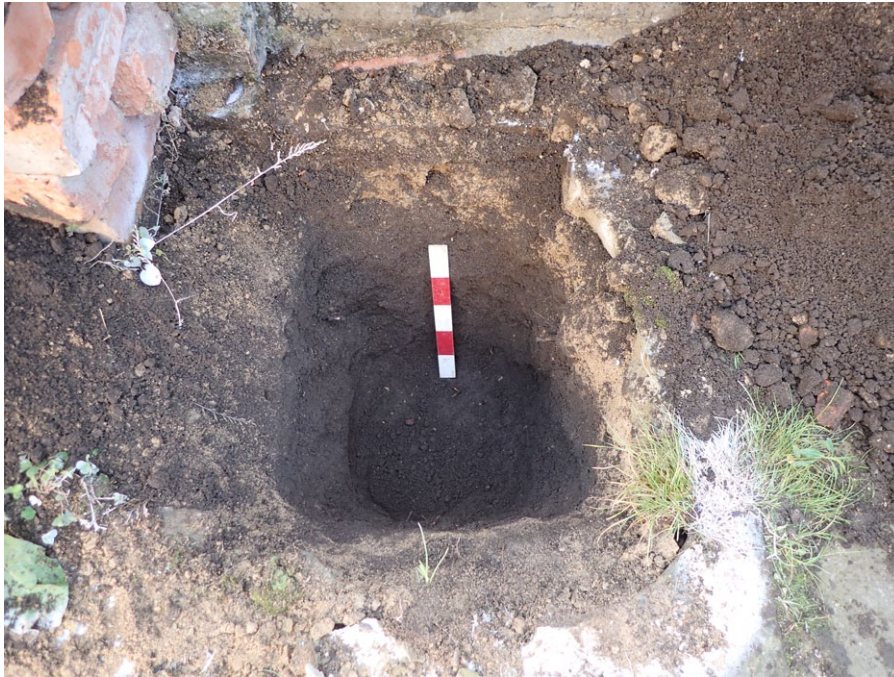
Fig. 4 - Shot of Pad 2 excavated to final depth through topsoil 0202, from the W