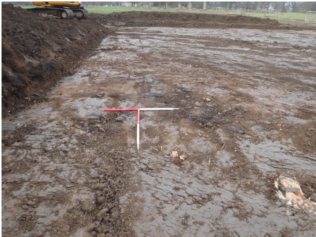
Fig. 3 - Cleaned area after root extraction in SW area

Project: Proposed Biomass Store at Arnistone House, Archaeological Monitored Strip