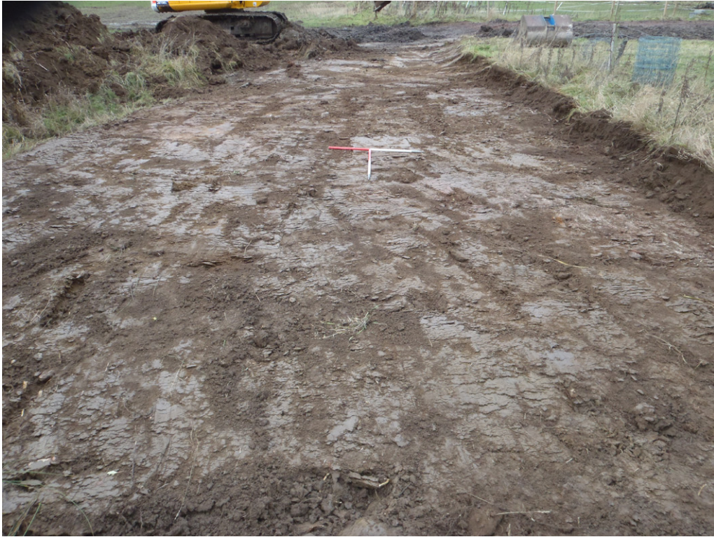
Fig. 2 - Post-ex strip area facing west