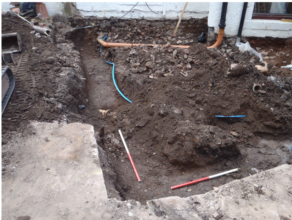
Fig. 3 General shot of Trench 2