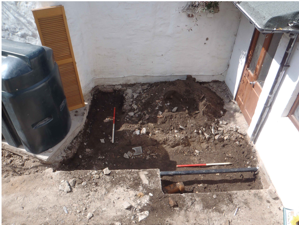
Fig. 2 General shot of Trench 1