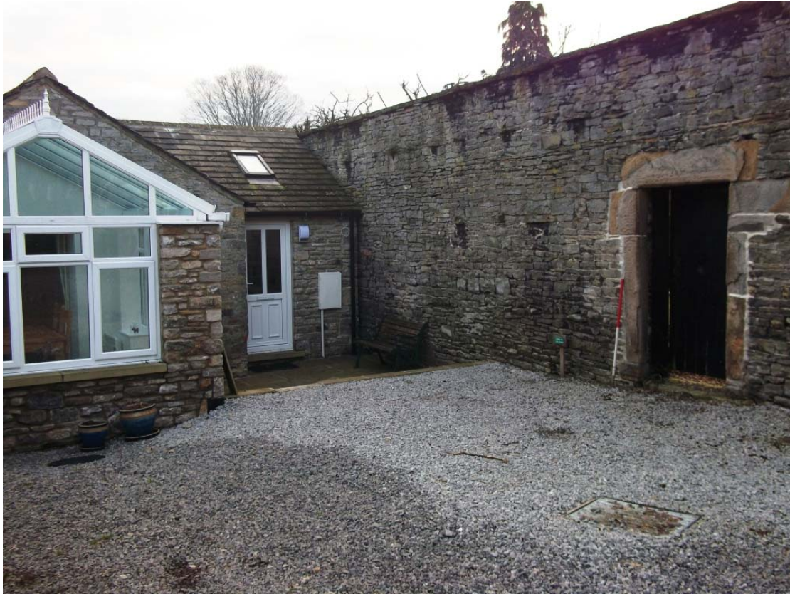
Plate 1: The Excavation Area Prior to Trenching