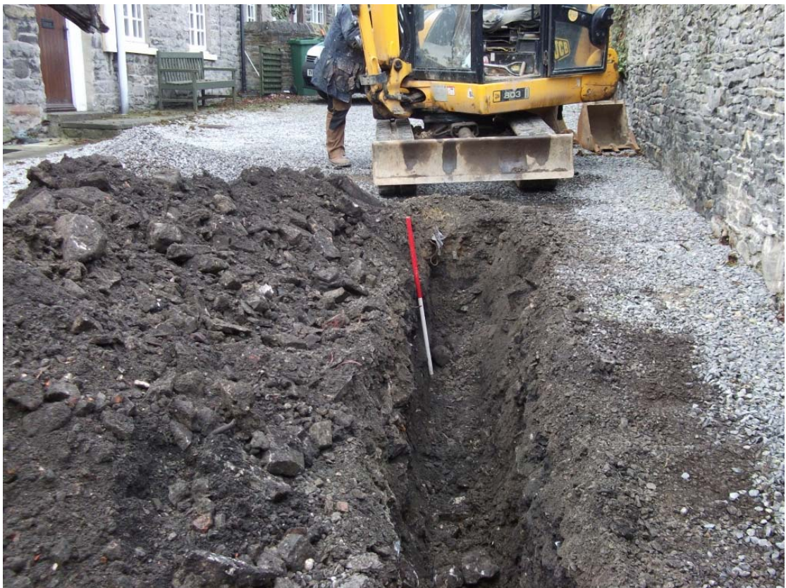
Plate 4: Excavated Trench 2