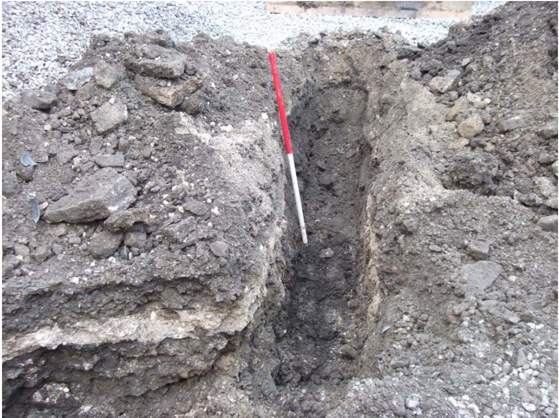
Plate 3: Excavated Trench 1