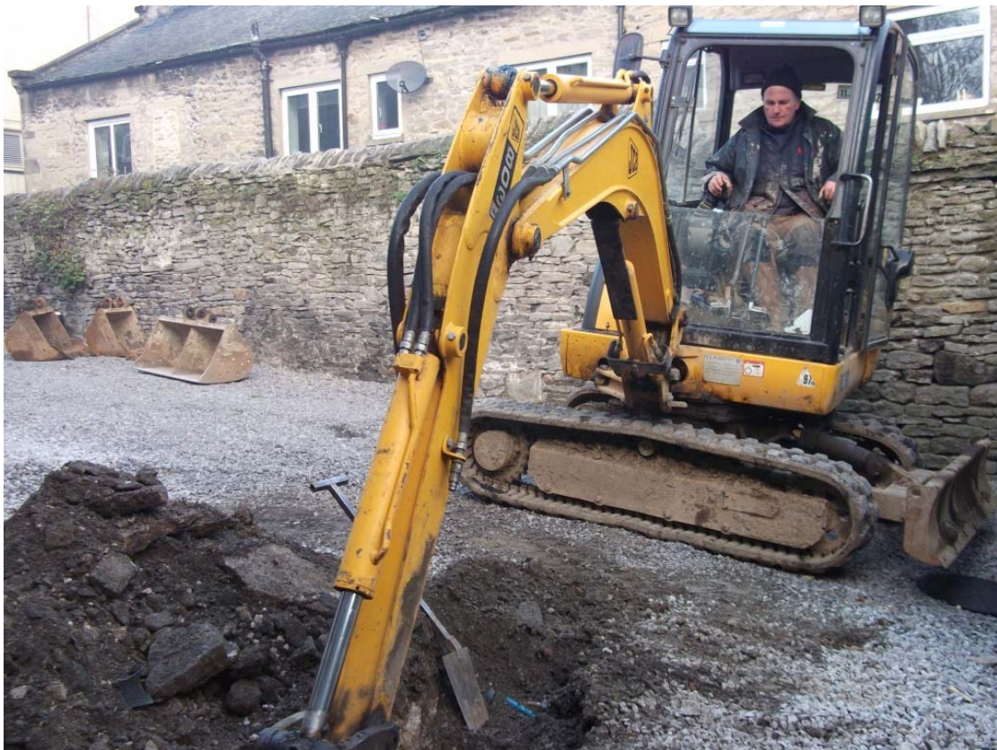
Plate 2: Working Shot During the Excavation of Trench 1