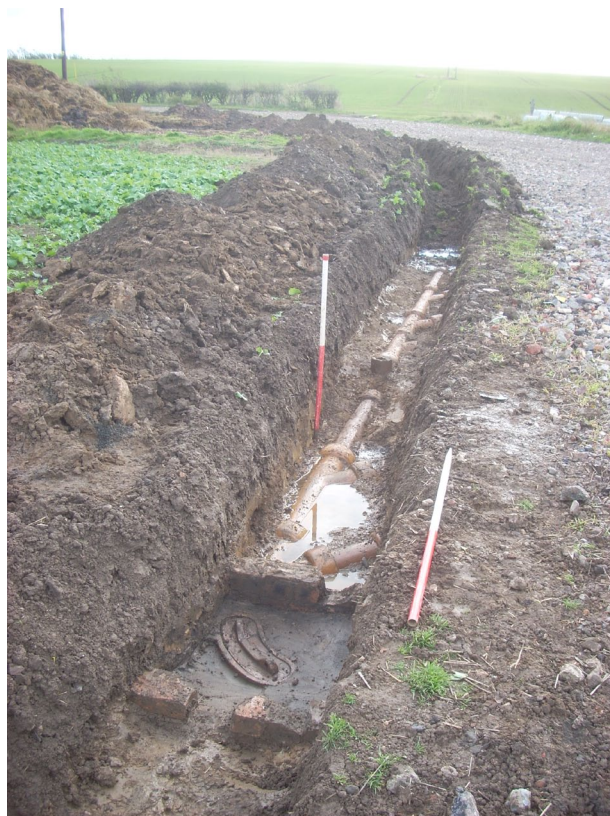
Fig. 5 - General view of the drain remains from the north, with the manhole and rodding eye in the foreground