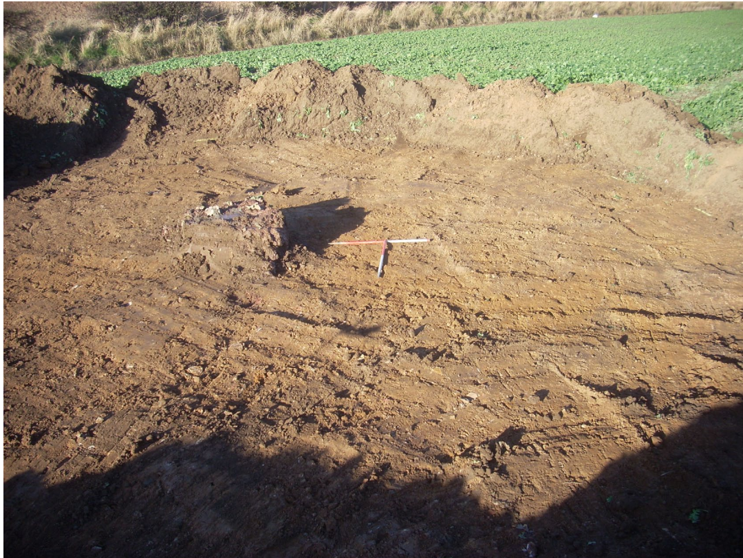
Fig. 2 - View of the turbine base from the east