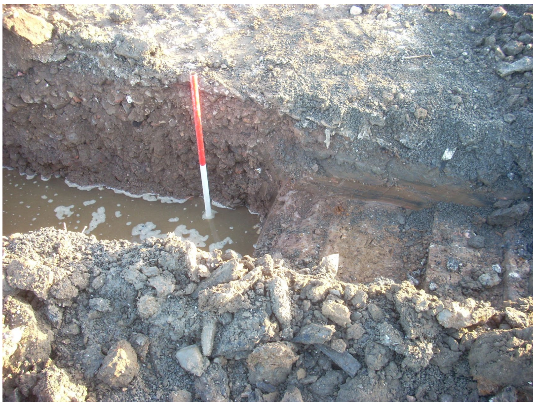
Fig. 3 - View of cut (001) in the farm yard filled with crushed brick and concrete (002)