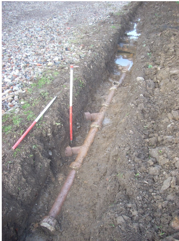
Fig. 4 - General view of the drain remains from the south