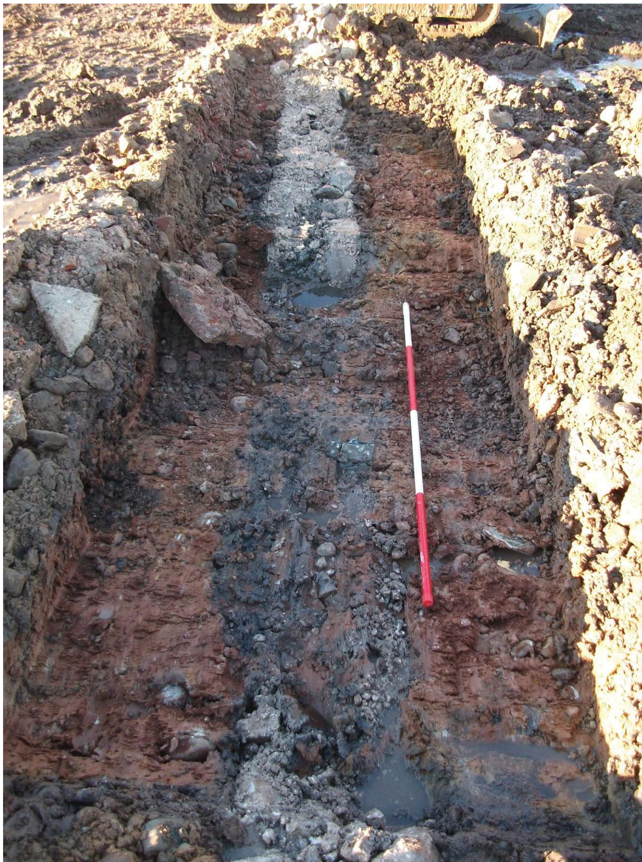
Fig 2. Photo of exposed north wall, Building 4, looking E