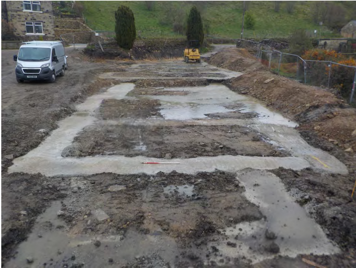
Fig. 4 Shot of Plot 1 and 2 with concrete footing, looking south-east