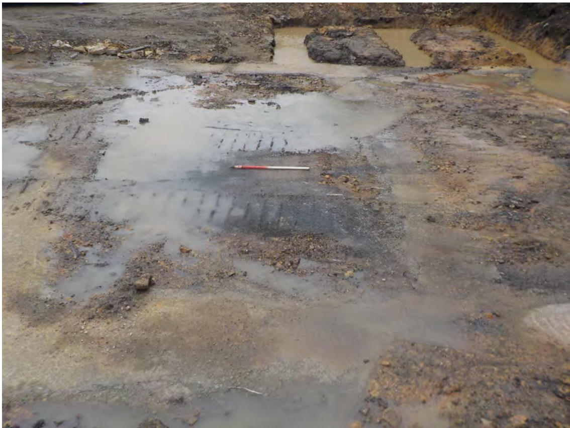
Fig. 3 Shot of Plot 1 with concrete footings looking south