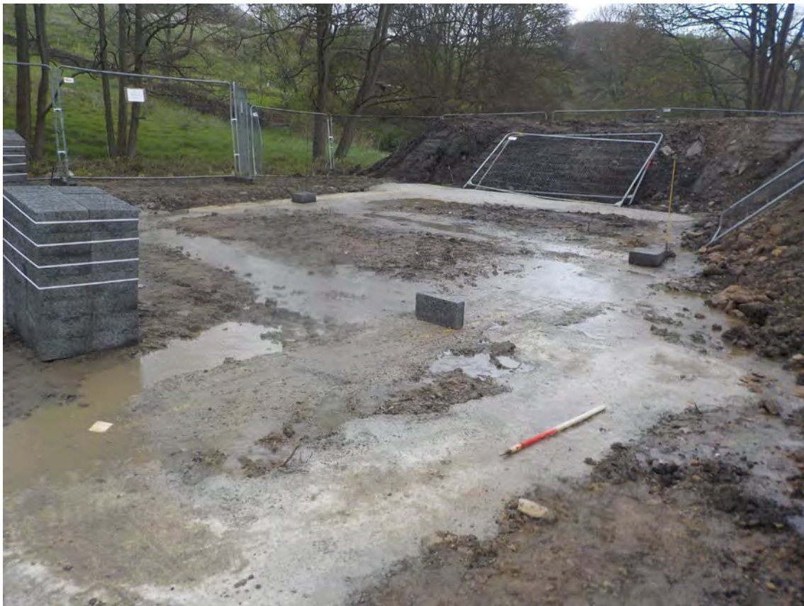
Fig. 5 Shot of Plot 3 with concrete footings looking north-west