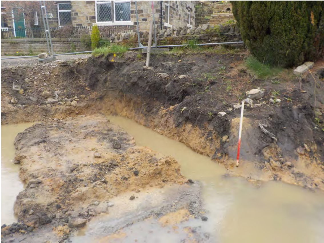
Fig. 2 Shot of Plot 1 after excavation of footings