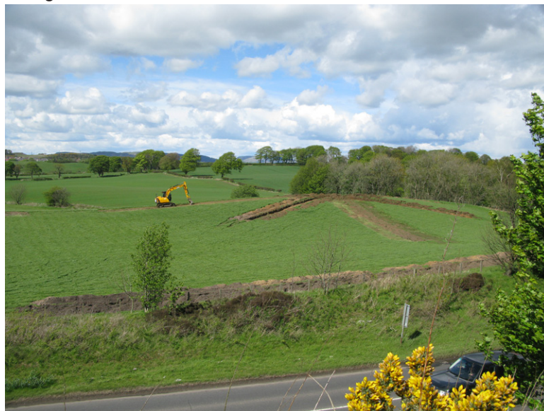
Fig. 7 - Easternmost evaluated hillock from Gallows Knowe