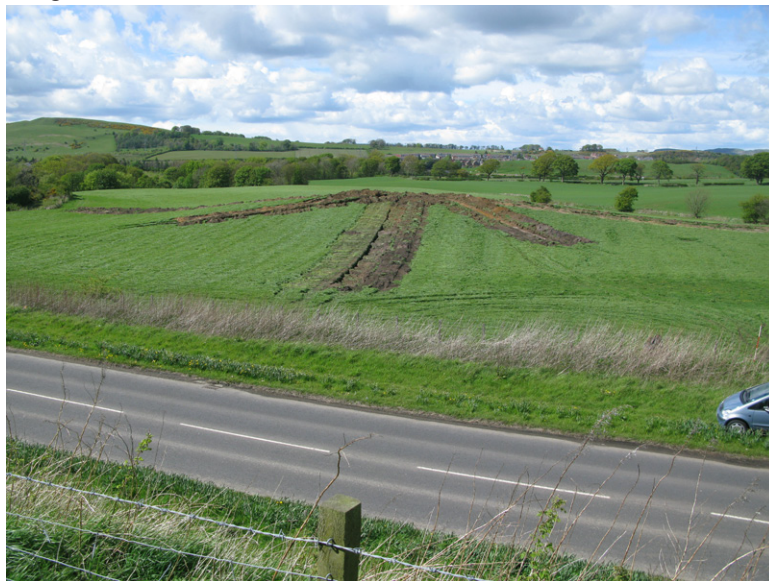
Fig. 6 - Westernmost evaluated hillock from Gallows Knowe