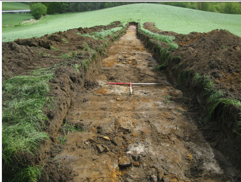
Fig. 2 - Trench 3 from west