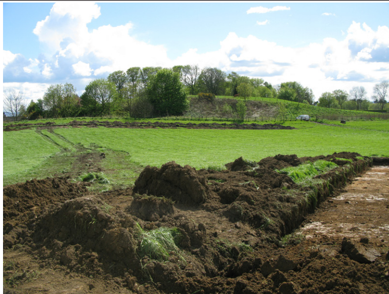
Fig.5 - Gallows Knowe from easternmost of evaluated hillocks