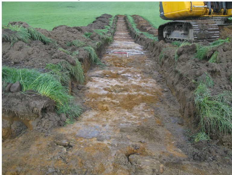
Fig. 3 - Trench 4 from south