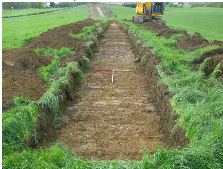
Fig. 4 - Trench 5 from east