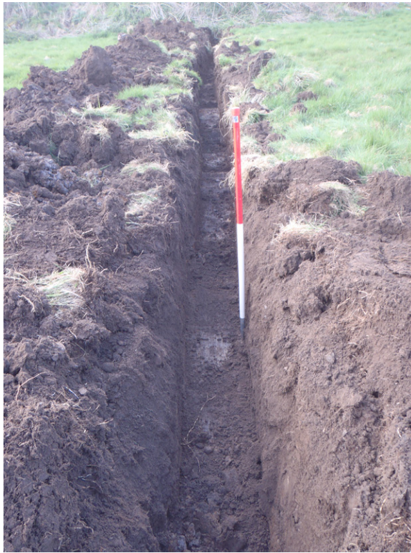
Fig.6 Electricity service trench during excavation

Project: Erection of a marquee stand and associated services trenches at Duntarvie Castle, Winchburgh, West Lothian