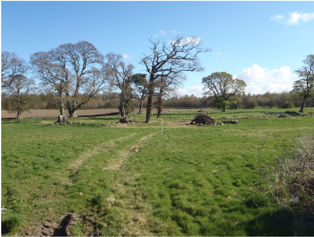
Fig.2 Area of Watching Brief prior to works