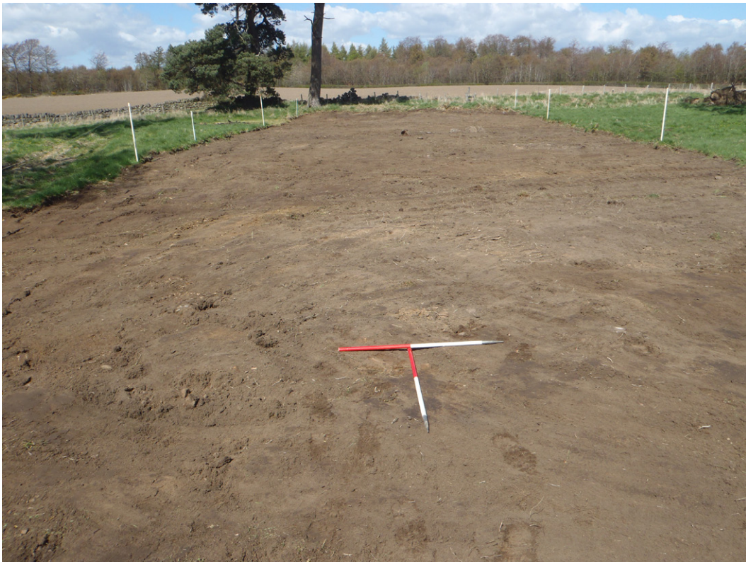
Fig.3 Area of marquee stand, post excavation

Project: Erection of a marquee stand and associated services trenches at Duntarvie Castle, Winchburgh, West Lothian