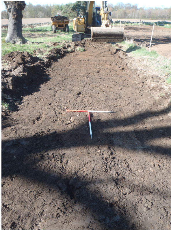
Fig.4 Access/delivery road during excavation