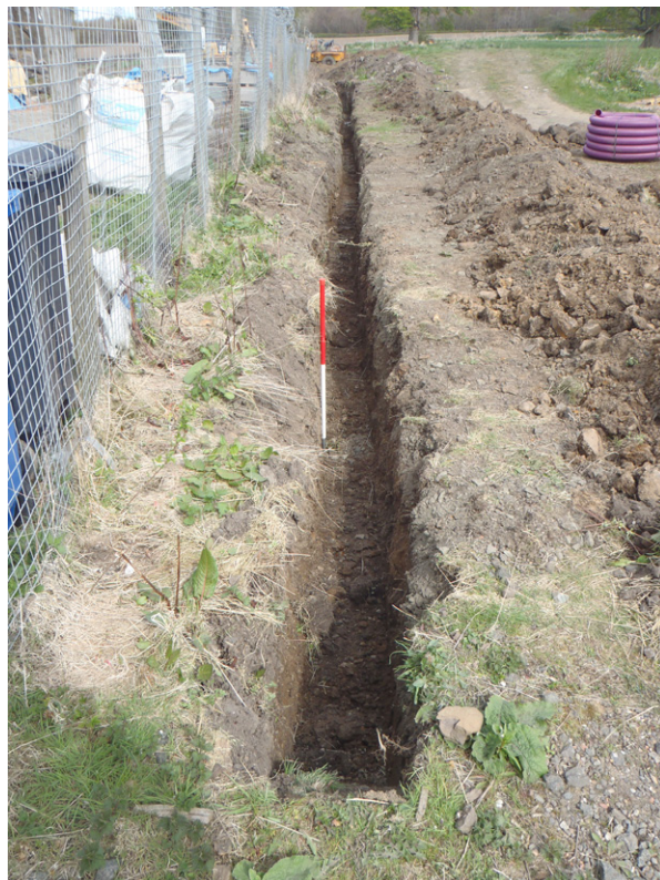
Fig.5 Water service trench during excavation

Project: Erection of a marquee stand and associated services trenches at Duntarvie Castle, Winchburgh, West Lothian