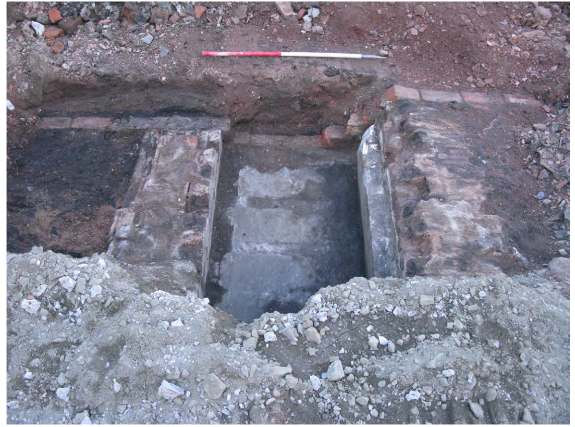
Fig. 4 - Structure 1007/1008