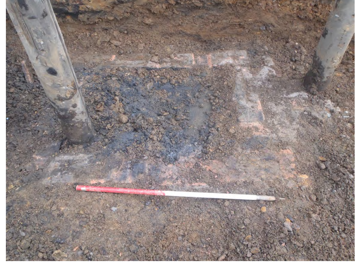
Fig. 2 - Brick structure 1023