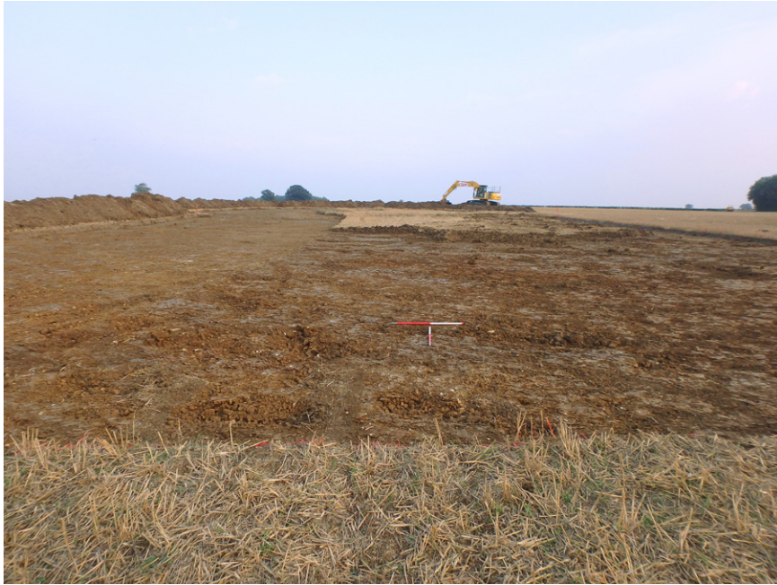
Fig. 3 - Overview of the crane pad taken from NW