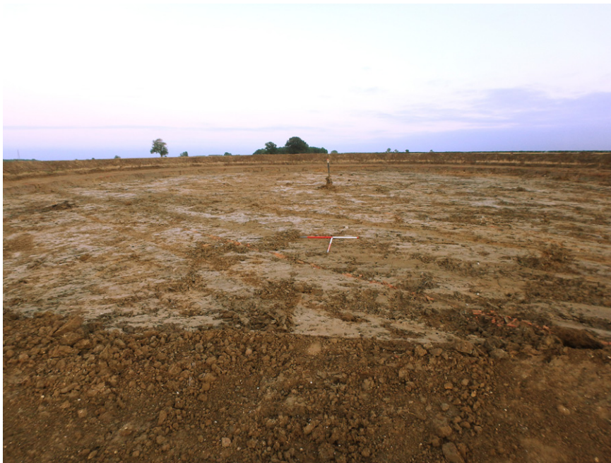
Fig. 4 - Overview of the turbine base taken from NW

Project: Burton Wolds Windfarm Extension, Burton Latimer, Northamptonshire: Archaeological Strip, Map and Record