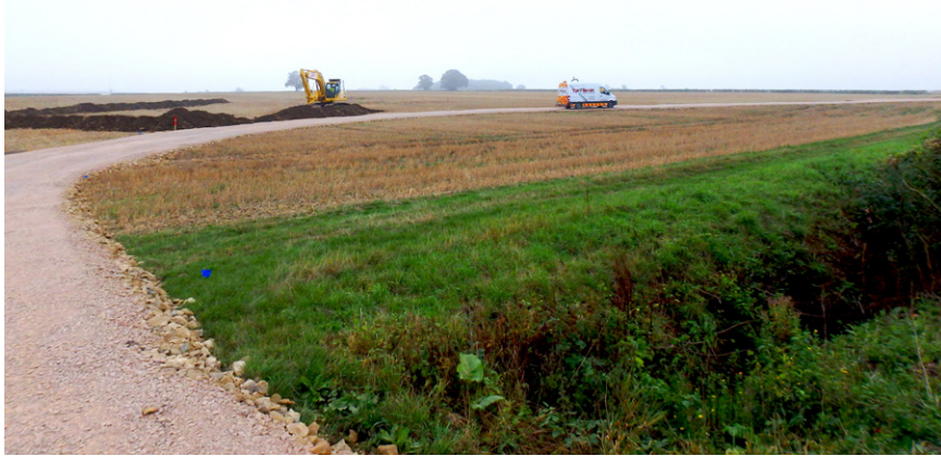
Fig. 5 - Floated access road built past central turbine, taken from W

Project: Burton Wolds Windfarm Extension, Burton Latimer, Northamptonshire: Archaeological Strip, Map and Record