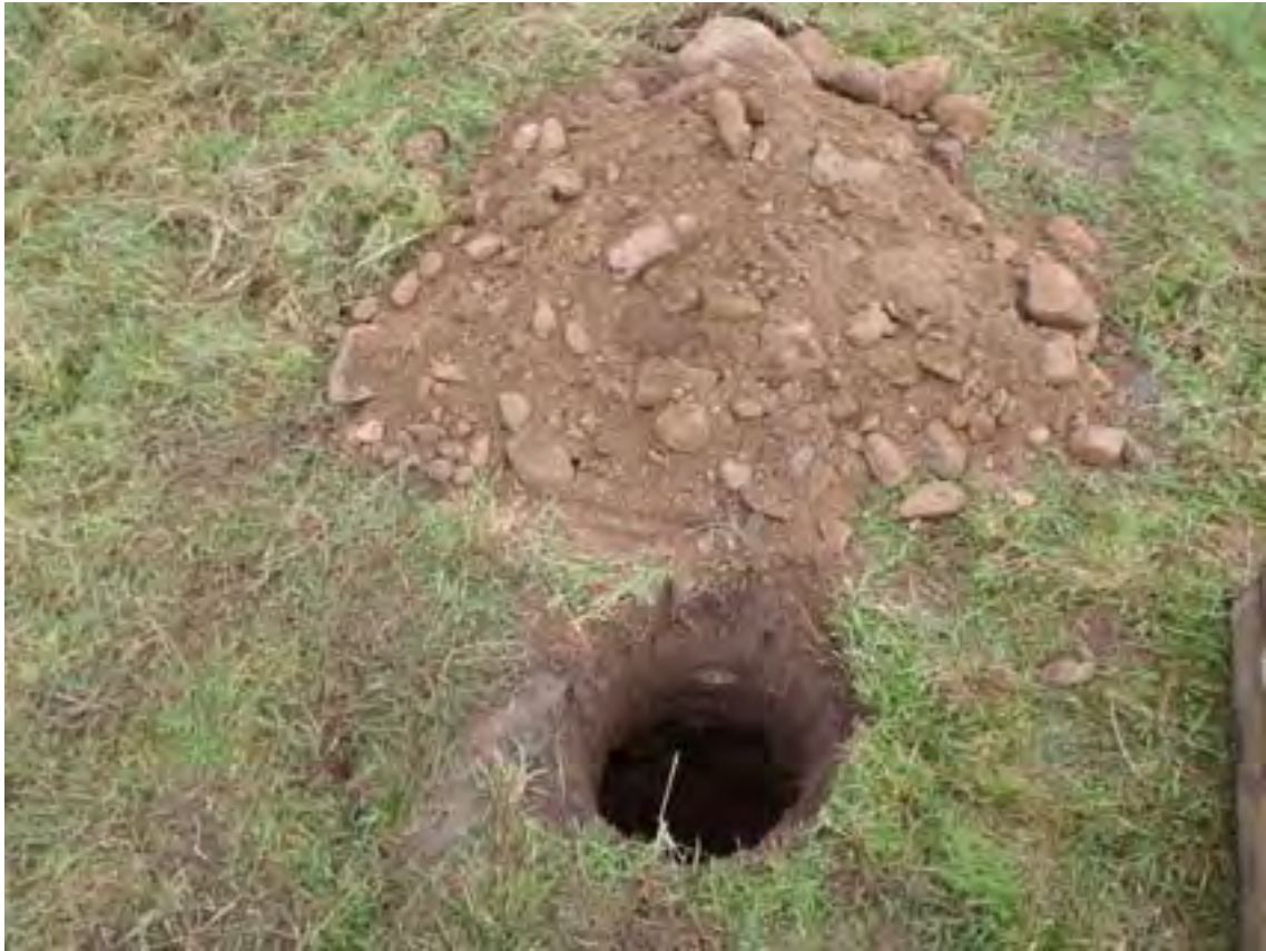
Fig. 1 Borehole BH 27600