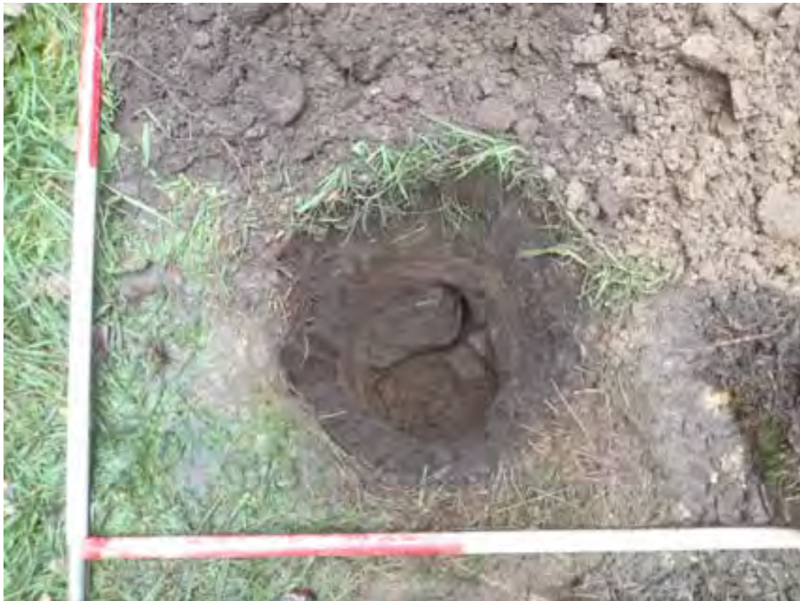
Fig. 6 Borehole BH 29900