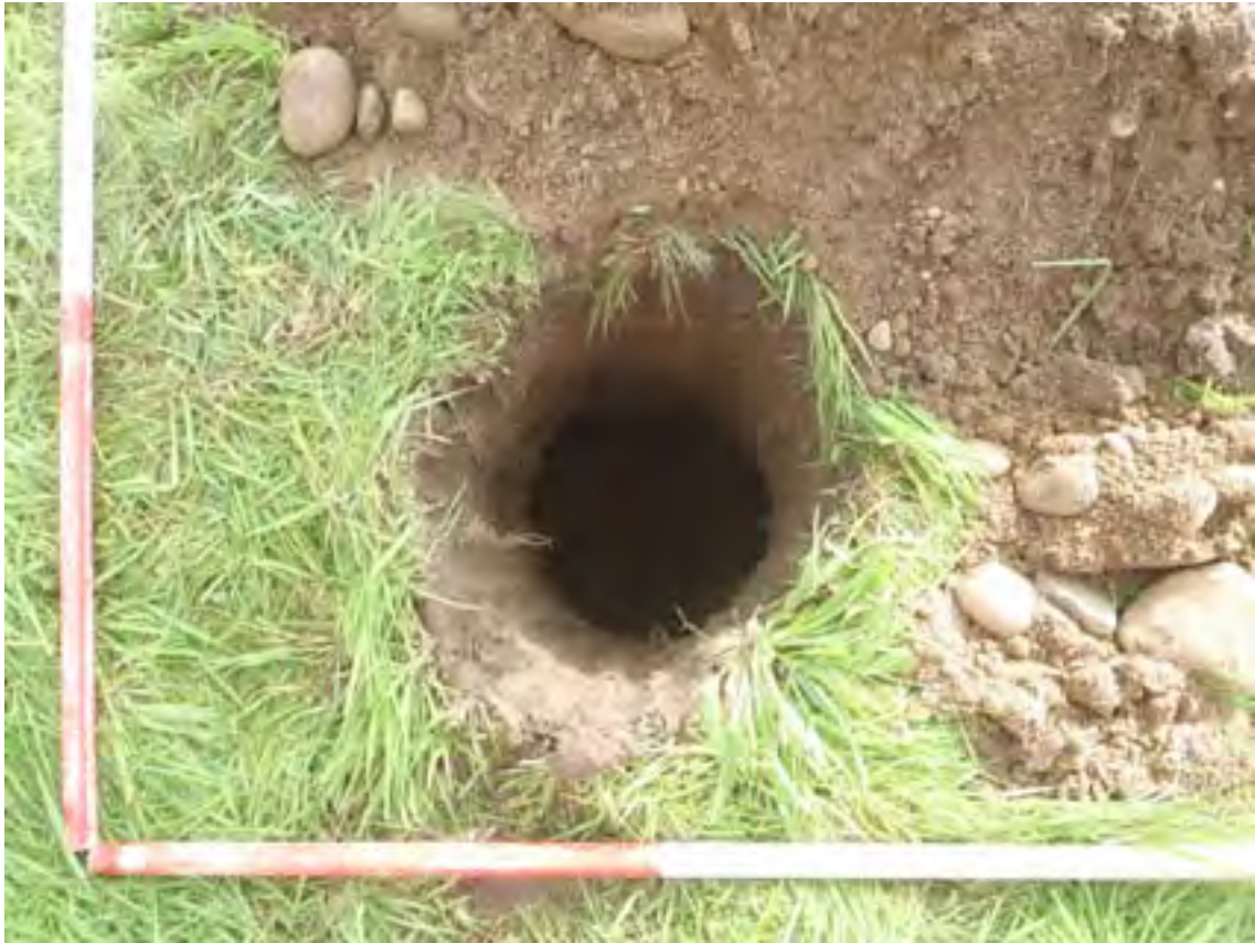
Fig. 3 Borehole BH 28400