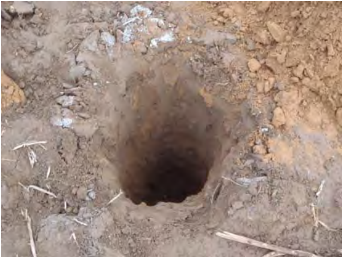
Fig. 2 Borehole BH 27700