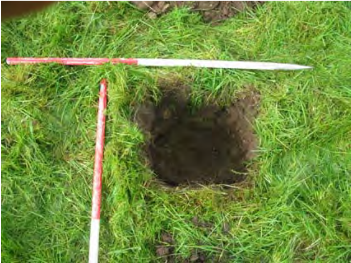
Fig. 5 Borehole BH 29400