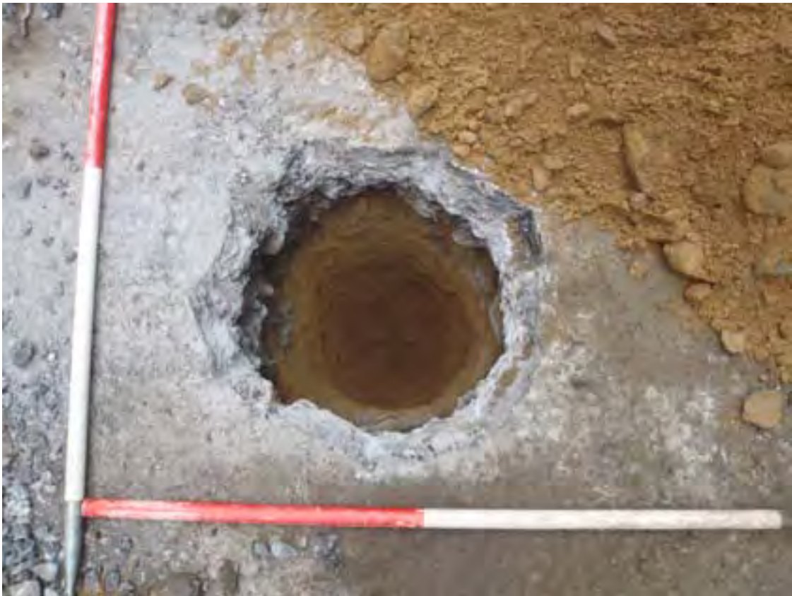
Fig. 4 Borehole BH 29100