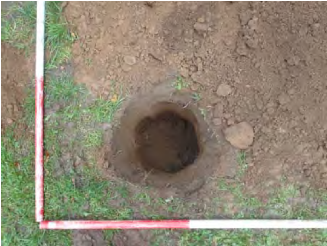
Fig. 7 Borehole BH 30500