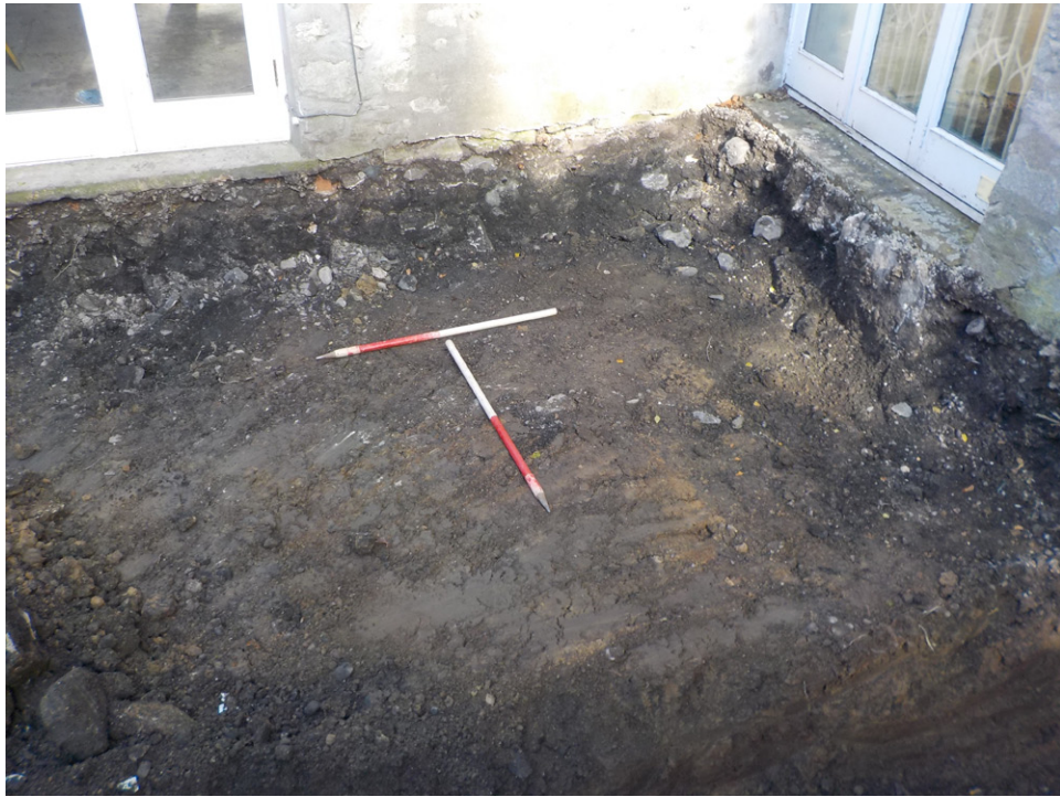
Fig. 4 - Post-excavation of site

Project: Conservatory Extension at old Parsonage Farmhouse, Beetham, Milnthorpe, Lancashire