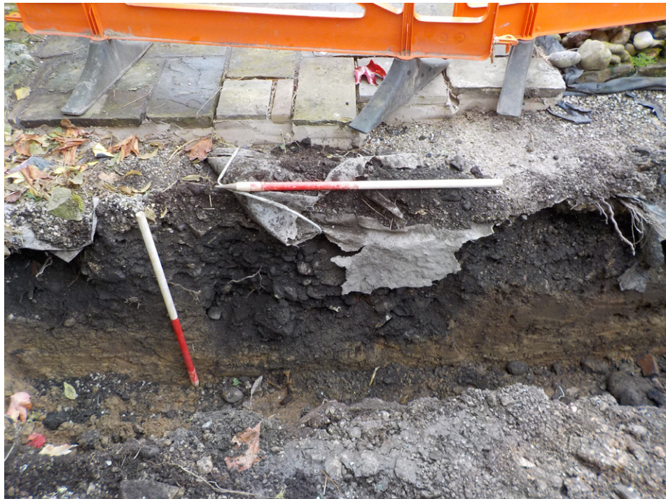
Fig. 3 - North-facing section of foundation trench with copper pipe service

Project: Conservatory Extension at old Parsonage Farmhouse, Beetham, Milnthorpe, Lancashire