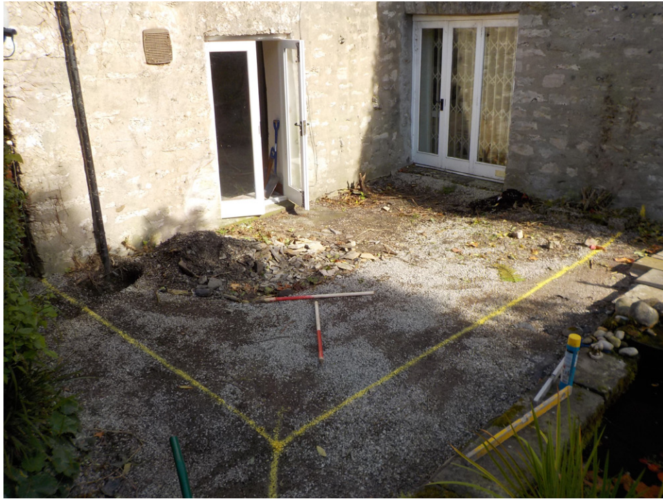
Fig. 2 - General pre-excitation of site