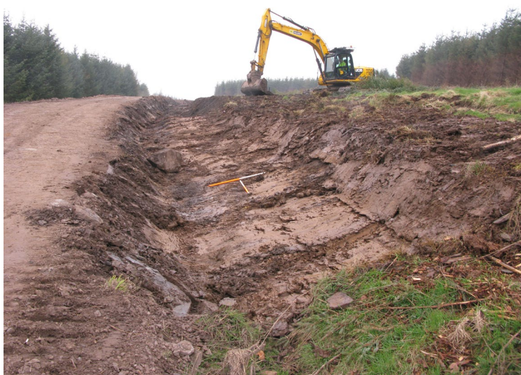
Fig. 4 - Working shot of road widening to east of Site 8