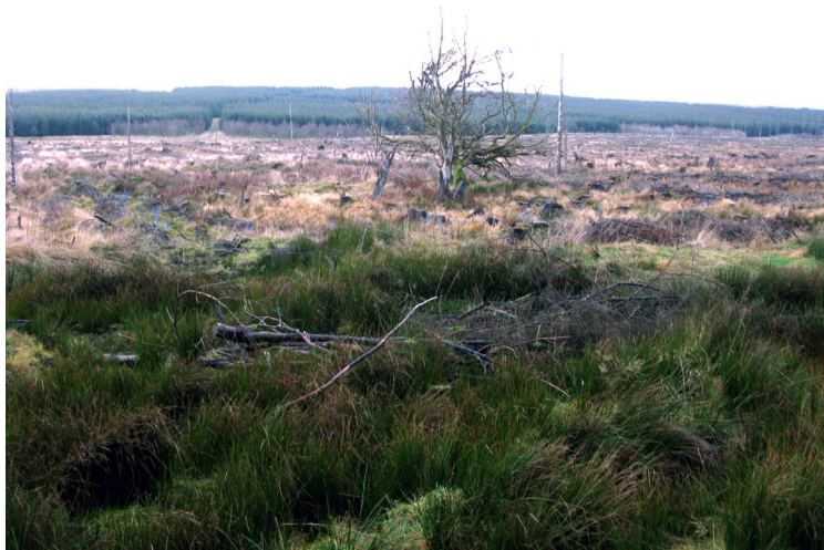
Fig. 2 - Site 19 demarcated using blue posts