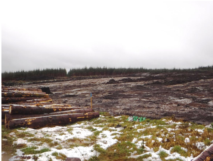
Fig. 3 - Compound area