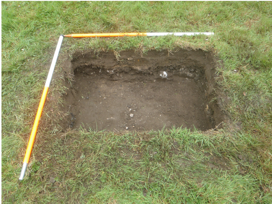
Fig. 3 - ABD 12 post-excitation from the SW