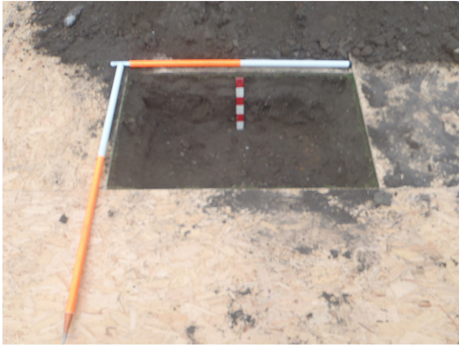
Fig. 2 - ABD 2 post-excitation from the NE