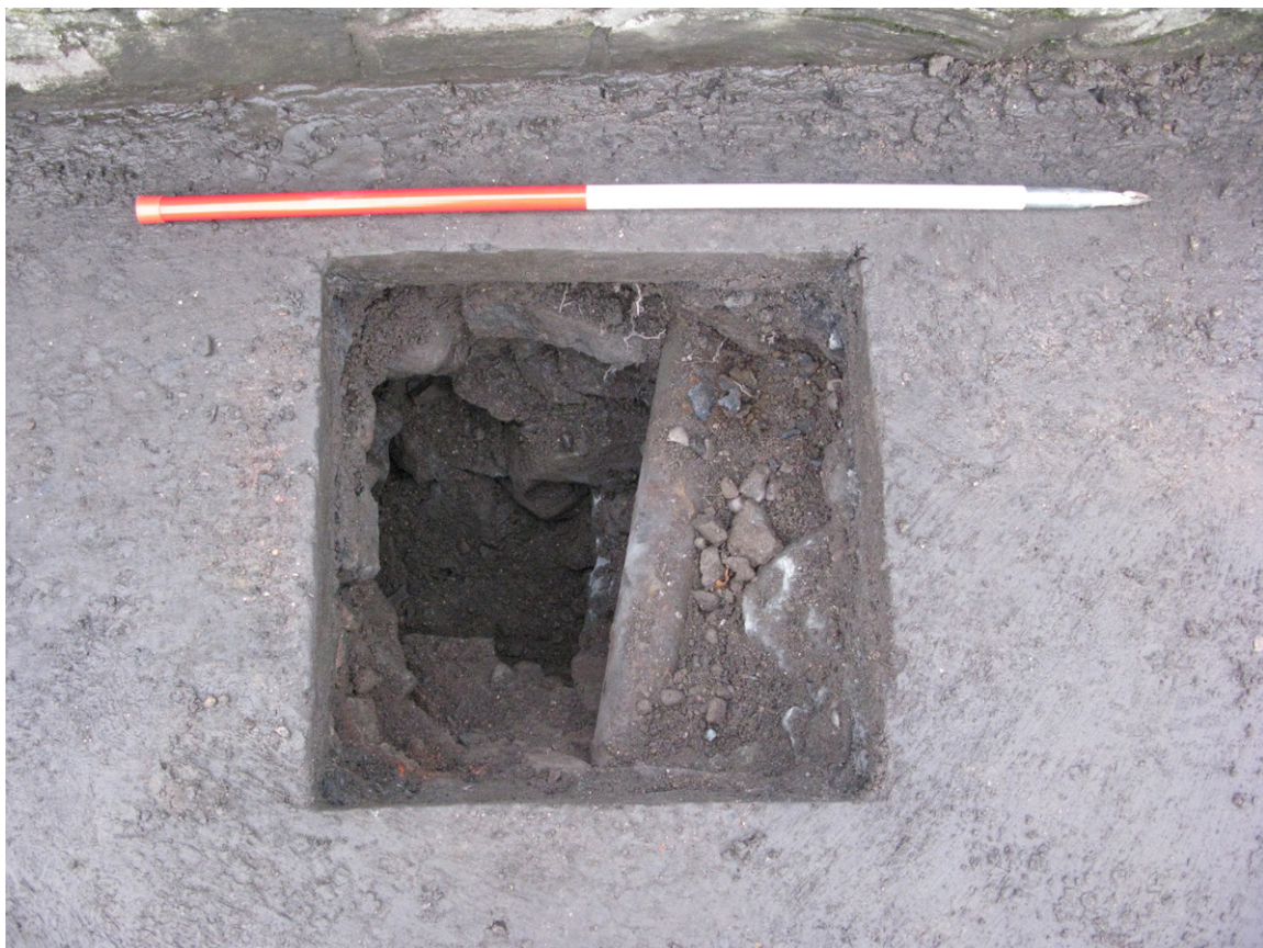
Fig. 3 - HInge post excavation