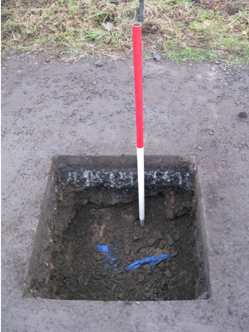
Fig. 4 - Latch post excavation