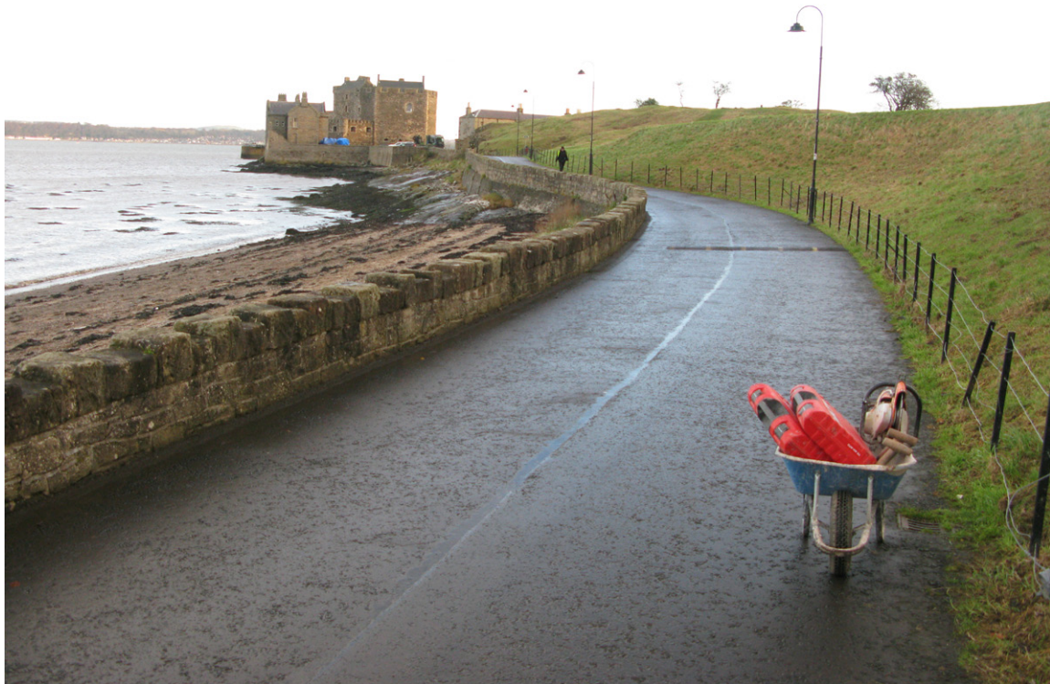
Fig. 2 - General view of watching brief location