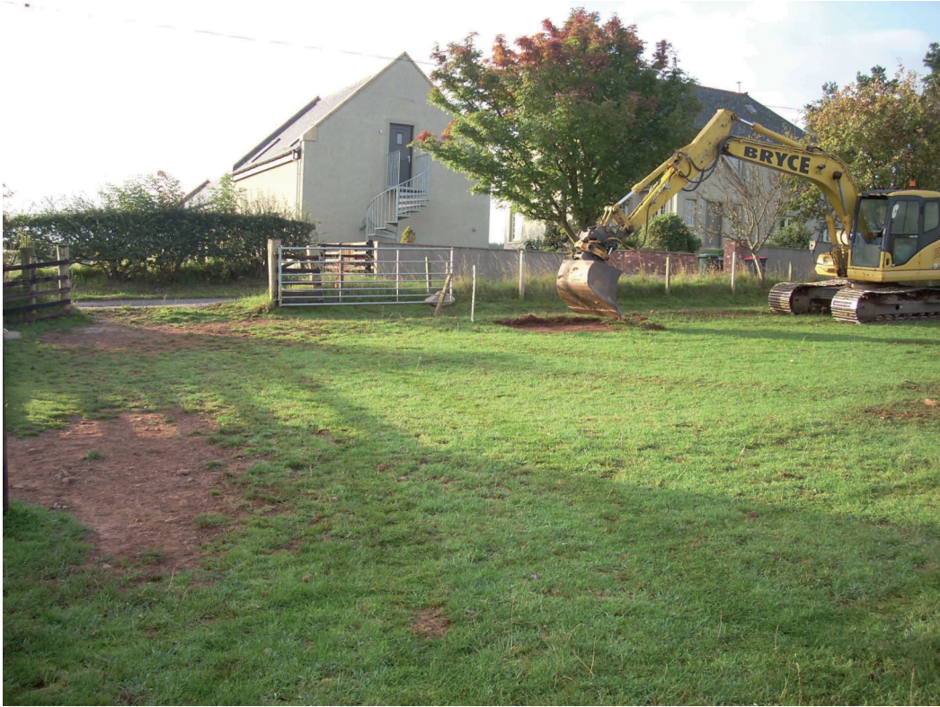
Fig. 2 - General shot