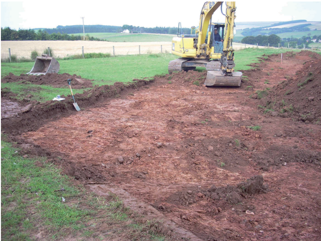
Fig. 3 - General shot of trench