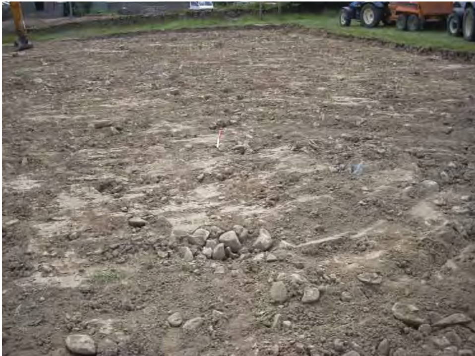
Fig. 3 Photograph from the north of the stripped area. A stone filled filed drain runs to the right of the scale