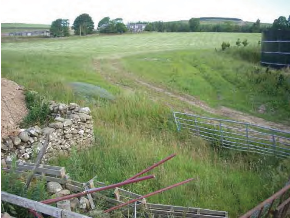
Fig. 2 Photograph from the south-east of the location of the new shed prior to topsoil stripping