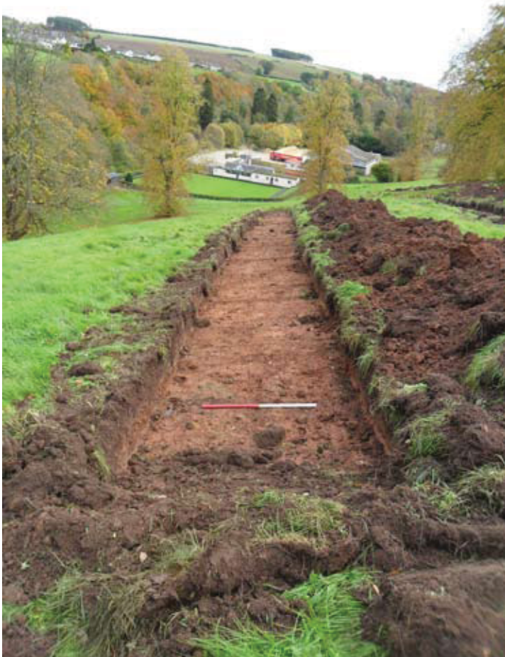
Fig 2. Post excavation shot of Trench 9