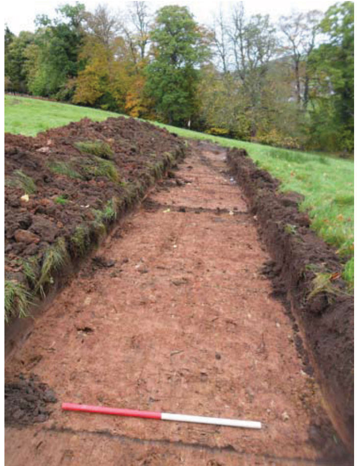
Fig 3. Post excavation shot of Trench 8