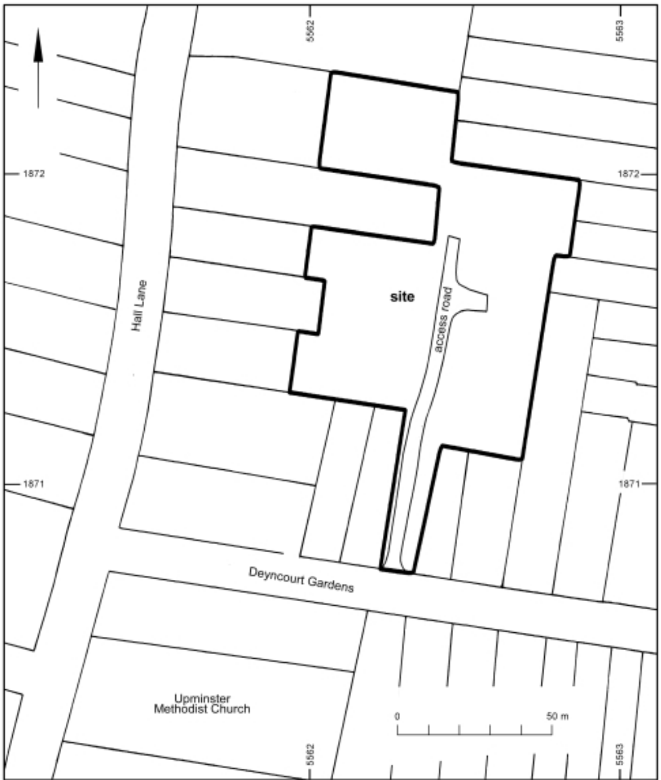
Fig 2 Site plan, showing access road.