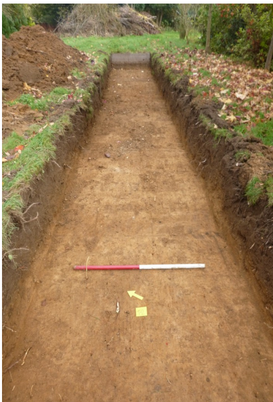
Plate 5 Trench 2 (view northeast)

Trench 2 (T2) was 13 m long and oriented southwest-northeast central within the footprint of the proposed new garage and outbuilding (Fig 1). No features of archaeological significance were located within this trench (Plate 5), the base of which consisted of undisturbed natural (L4).