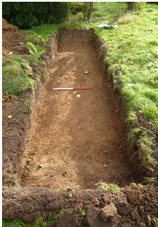
Plate 2 Trench 1A (view southeast)

Trench 1 (T1) was orientated north-west-southeast central within the footprint of the proposed new house. It was planned as a single trench 13 m long (CAT 2014 fig 1). In the event T1 had to be divided into two smaller (shorter) trenches Trench 1A & Trench 1B (Fig 1). These were separated by a 3.5 m break either side of an extant line of small trees T1A (Plate 2) & T1B (Plate 3). T1A was 6.5 m long and T1B 5.5 m (total length 12 m).