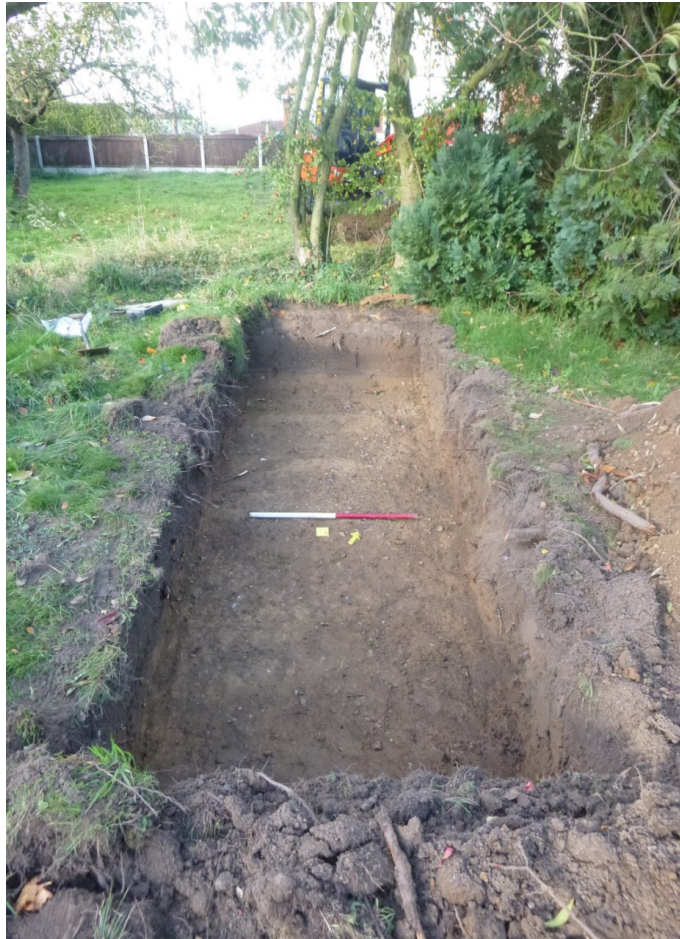
Plate 3 Trench 1B (view northwest)

A small, shallow feature (F1) cut into the natural (L4) was located approximately at the centre of Trench 1A at a distance of 3 m from its north end (Fig 1). A hand excavated half section of this feature (Plate 2) showed it to be filled with medium brown clay-silt but no finds were present within the excavated section. It is interpreted as the base of a possible post-hole, but is of uncertain date.