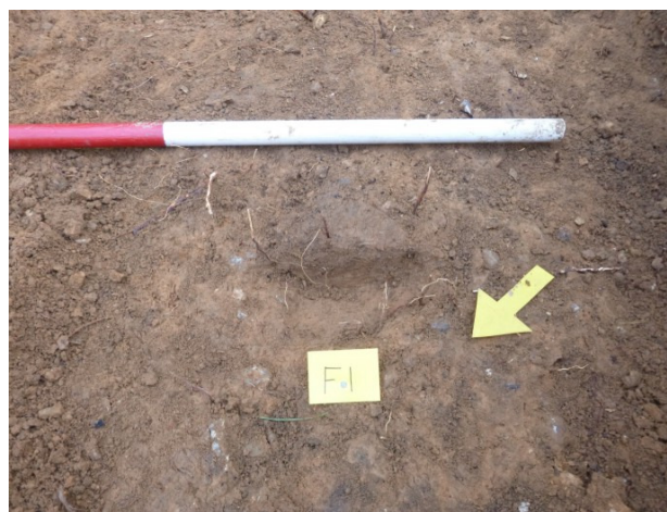
Plate 4 Feature F1 (view southeast)

A small, shallow feature (F1) cut into the natural (L4) was located approximately at the centre of Trench 1A at a distance of 3 m from its north end (Fig 1). A hand excavated half section of this feature (Plate 2) showed it to be filled with medium brown clay-silt but no finds were present within the excavated section. It is interpreted as the base of a possible post-hole, but is of uncertain date.