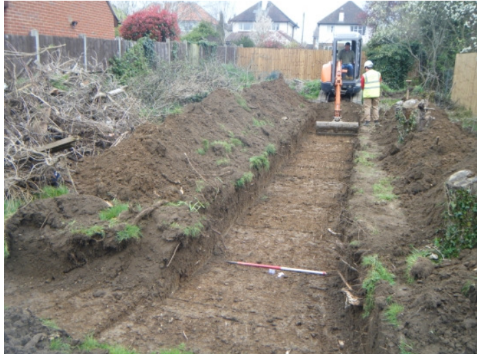
T2 view north