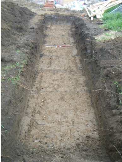
T1 view south