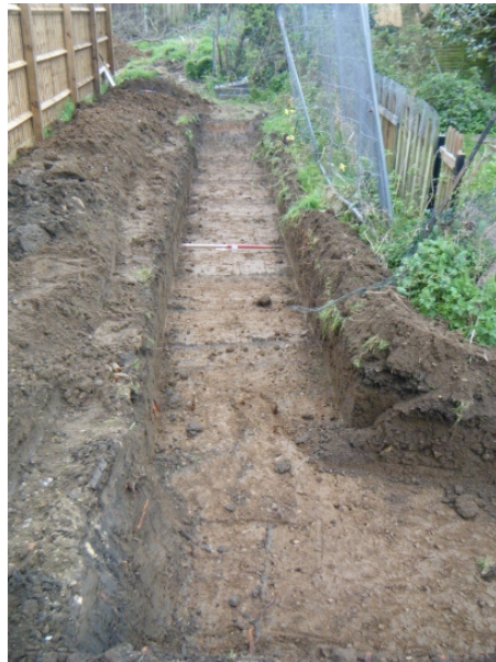
T3 view west