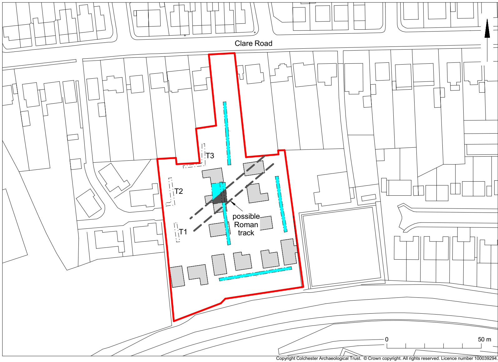
Fig 1 Site location showing the 2014 evaluation trenches (T1-3) in relation to the 2012 evaluation and excavation.