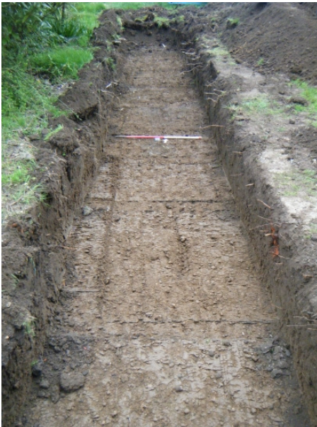
T3 view north