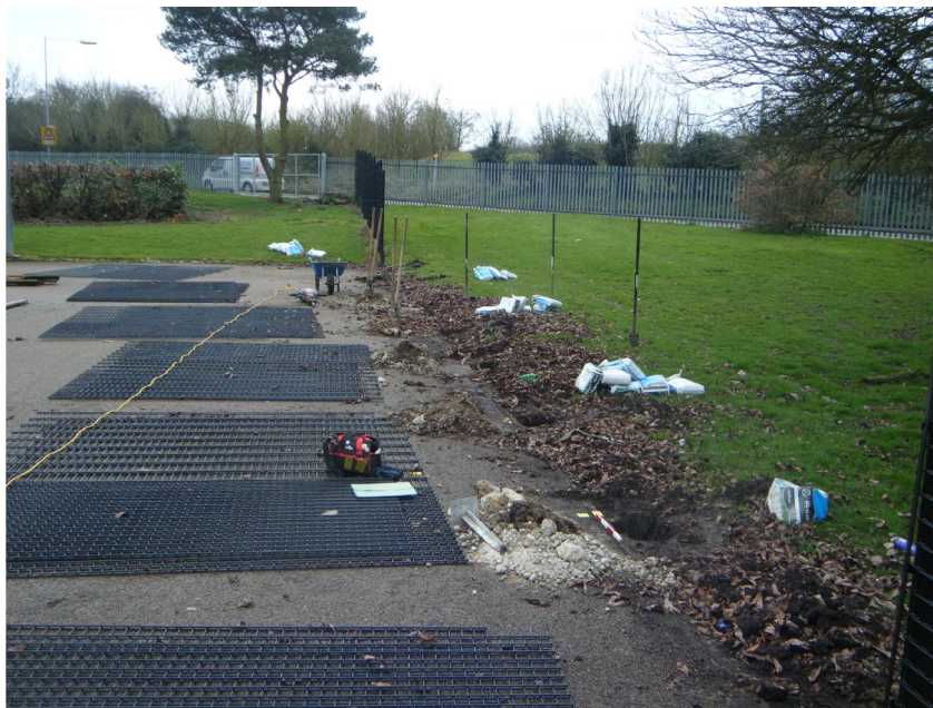
Plate 1: General site shot

Spoil heaps were trowled and metal-detected but almost all finds recovered were modern and were not retained. Only one posthole (TP4/5) contained any archaeological material. This contained a small piece of kiln or oven material. Unfortunately, due to the nature of the postholes, no context was discernable for this material.