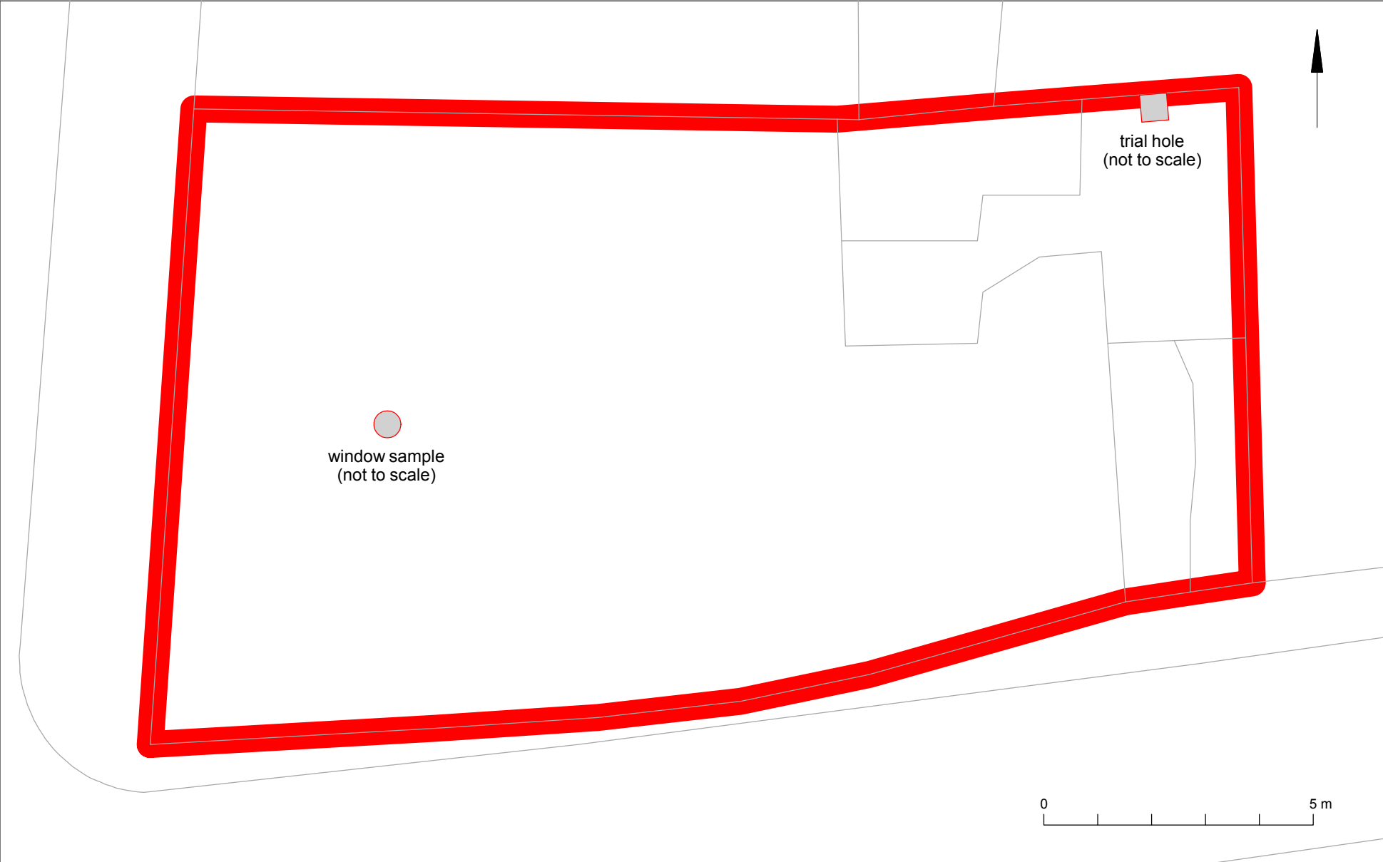
Fig 2 Results