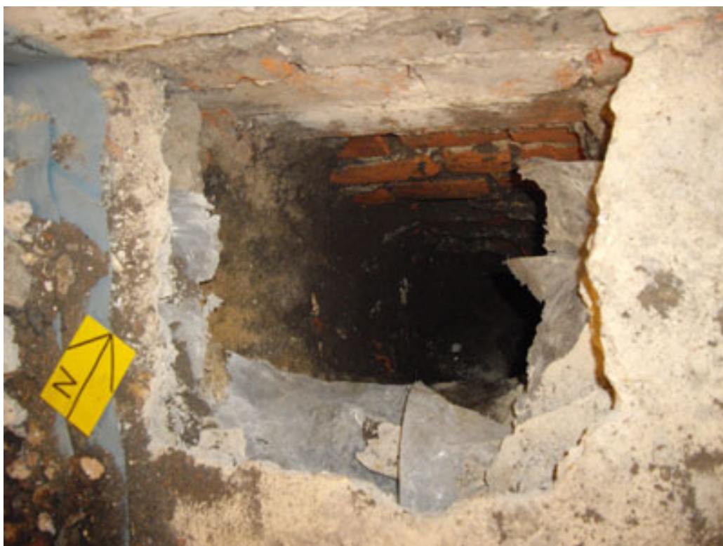
Photograph 1 Trial-hole, looking NW

of pottery, brick/tile and animal bone in section. Natural sands were encountered at a depth of 3.2m below current ground level.