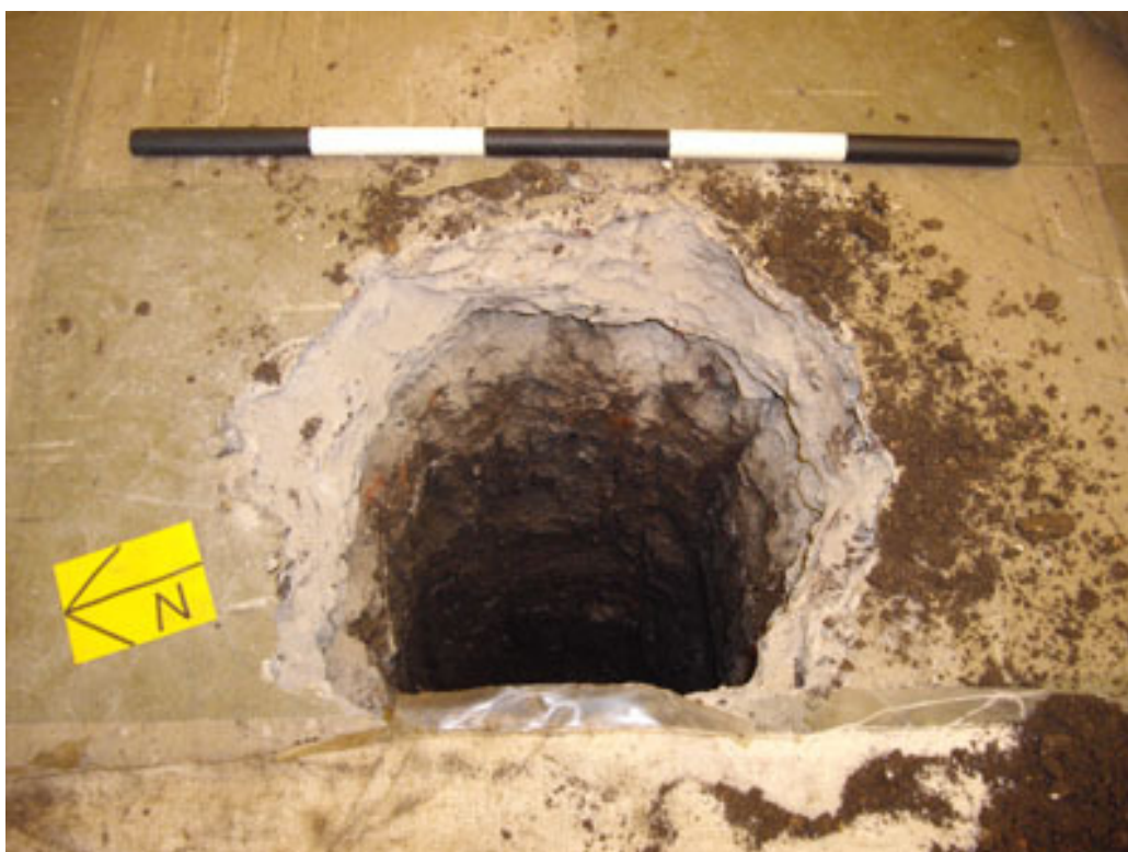
Photograph 2 Borehole, looking E