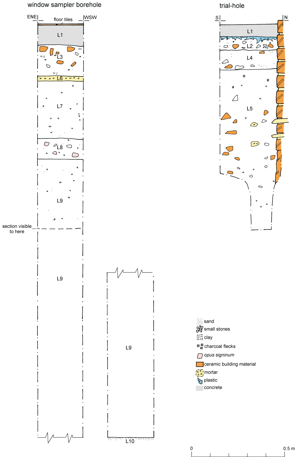
Fig 3 Representative sections.