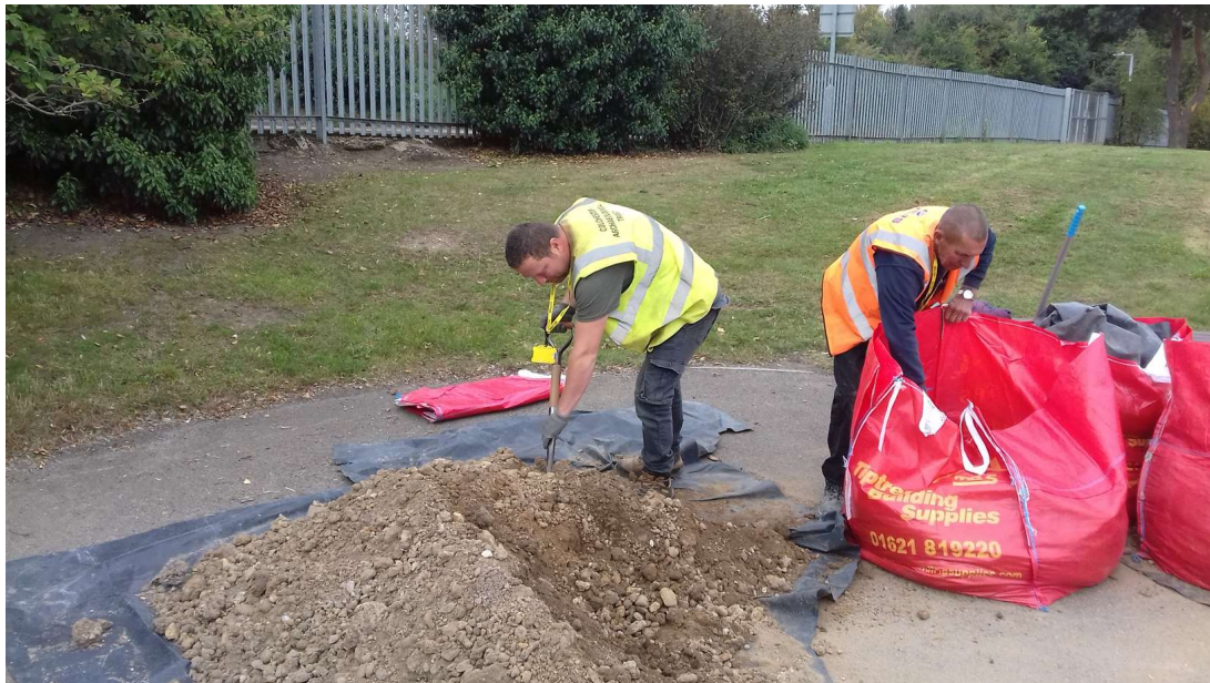
Photograph 1 Working shot

Each of the postholes was approximately 0.3m by 0.3m and, according to the contractors who carried out the work groundworks, were excavated to a depth of 0.4-0.6m. The spoil consisted of a soft, dry light/medium grey/brown silty-sand which was presumably a levelling layer underlying the tarmac surface of the playground, and so it appears that the groundworks did not penetrate beyond modern horizons.