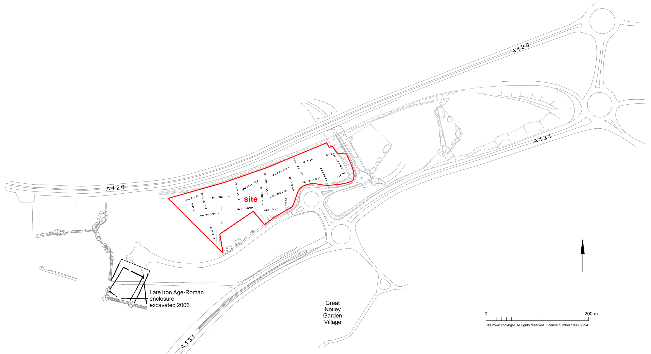
Fig 1 Site location, including the location of the Late Iron Age-Roman enclosure excavated in 2006.