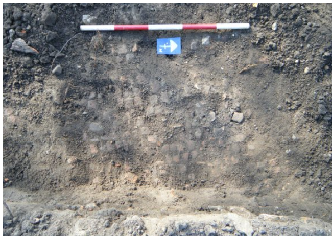
Plate 2: the exposed area of tessellated floor.

Test-pits excavated by CAT in 2007 and 2011 on the site of the former putting green indicated that no archaeological remains or deposits exist in this area within a metre of the modern ground-level (CAT Reports 422 and 575; Fig 2). However, these test-pits were all located within the northern half of the putting green and not in areas where archaeological remains are known to survive. The removal of topsoil for the new access road in the southern half of the former putting green revealed archaeological remains at a depth of 0.3m below modern ground-level. In this area, a lighter soil was exposed and, within this lighter soil, a small area of tessellated floor roughly 0.4m 2 was exposed (Plate 2, Fig 2). This Roman tessellated floor had been uncovered during excavations undertaken in 1927-9 (Hull 1958, 91). The remains of a probable Roman clay-block wall were also identified just to the south of the tessellated floor (Plate 3, Fig 2).