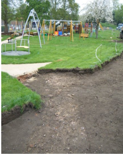
Plate 1: backfilled archaeological trench from excavations in 1927-9.

Test-pits excavated by CAT in 2007 and 2011 on the site of the former putting green indicated that no archaeological remains or deposits exist in this area within a metre of the modern ground-level (CAT Reports 422 and 575; Fig 2). However, these test-pits were all located within the northern half of the putting green and not in areas where archaeological remains are known to survive. The removal of topsoil for the new access road in the southern half of the former putting green revealed archaeological remains at a depth of 0.3m below modern ground-level. In this area, a lighter soil was exposed and, within this lighter soil, a small area of tessellated floor roughly 0.4m 2 was exposed (Plate 2, Fig 2). This Roman tessellated floor had been uncovered during excavations undertaken in 1927-9 (Hull 1958, 91). The remains of a probable Roman clay-block wall were also identified just to the south of the tessellated floor (Plate 3, Fig 2).