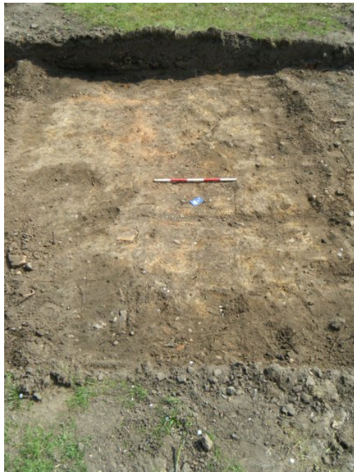
Plate 3: the remains of the probable clay-block wall.

An area of approximately 450m 2 was reduced by 0.25m so that tarmac and gravel could be laid to create new areas of hardstanding and car-parking in the park service yard (otherwise known as the park 'nursery'). The excavated material was mostly modern topsoil and old surfacing materials such as gravel. A small area of light brown/yellow clayey-silt containing frequent charcoal flecks, Roman brick and a sherd of Roman grey ware pottery was uncovered in the south-western corner of the stripped area (Fig 2). However, this deposit was located just beneath the turf and also contained a tarmac chipping. The deposit was not in situ and was probably disturbed from deeper down during previous works in the park service yard. No other archaeological deposits or features were observed during the monitoring of these groundworks and nor were any other finds recovered.