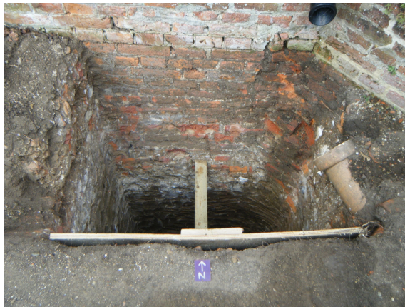
Plate 3: Pit 3, view north.