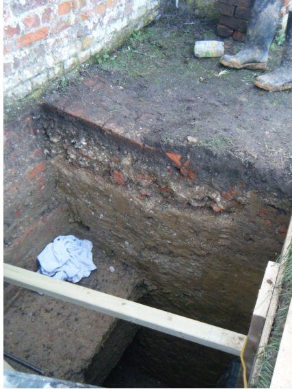
Plate 1: Pit 1, view west.