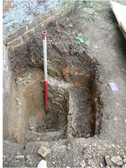
Plate 2: Pit 2, view north.