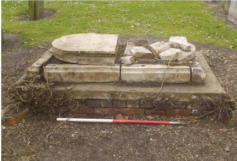
Plate 2 Grave monument F3, viewed from the south.

This monument has since been consolidated and the headstone incorporated into the plinth.