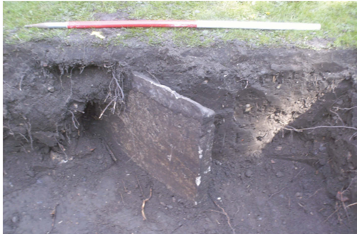
Plate 1 Headstone F1, viewed from the south-west.

inscription present. The headstone was 70 mm thick, and probing in the section indicated that it was 670 mm wide. It extended below the bottom of the trench. The top of the headstone lay only 100 mm below the modern ground-level and part of it was cut away by the contractors prior to concreting. The headstone was presumably set at the western end of a grave, all trace of which above ground has disappeared. It was probably of 19th-century date.