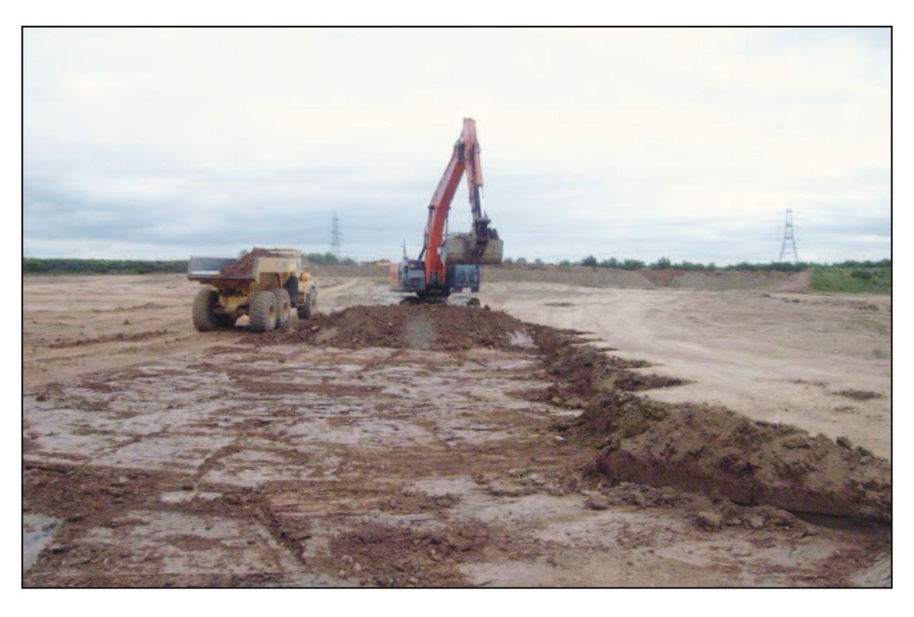
Plate 2: Subsoil strip for new building in progress (looking east)