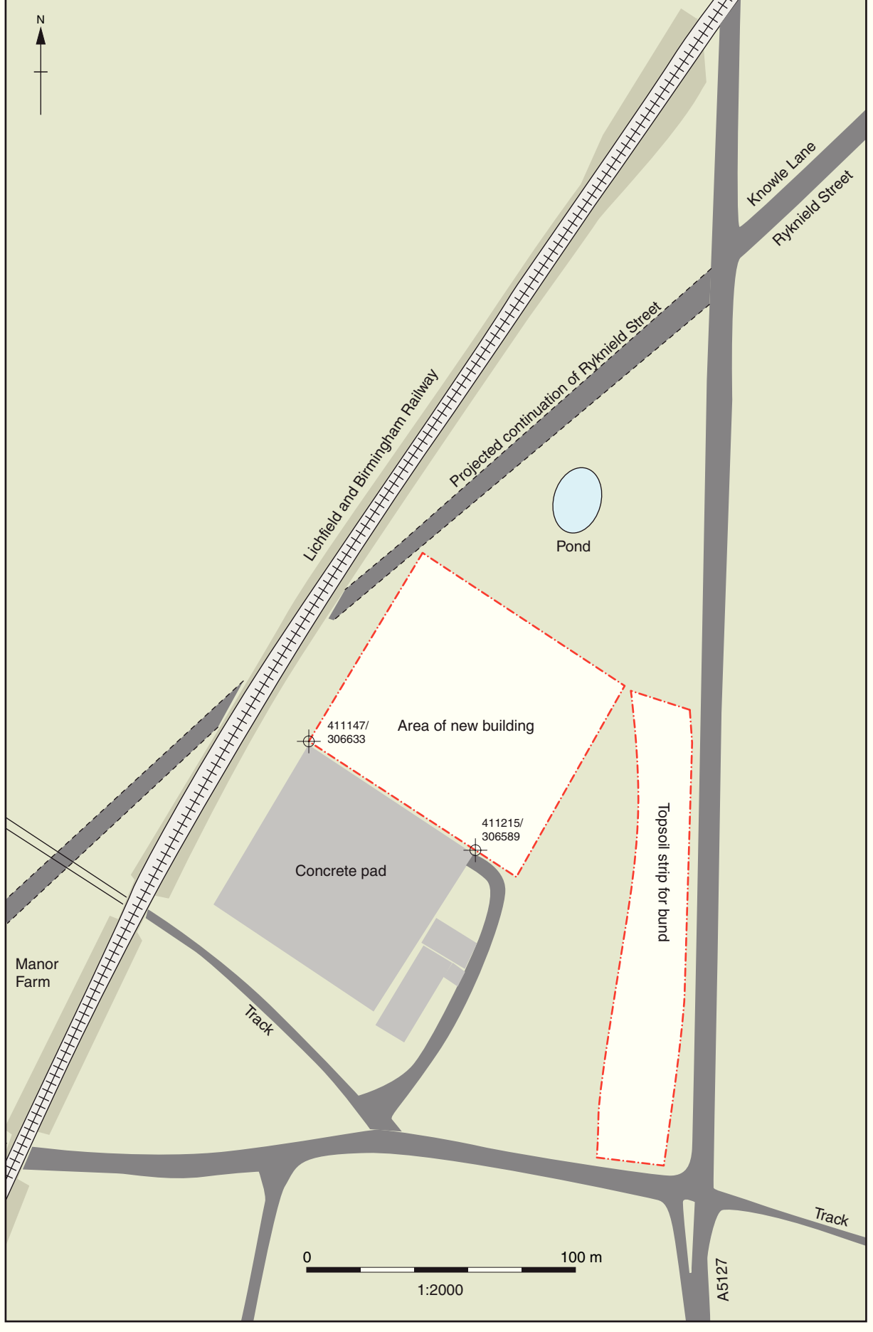
Figure 2: Site plan