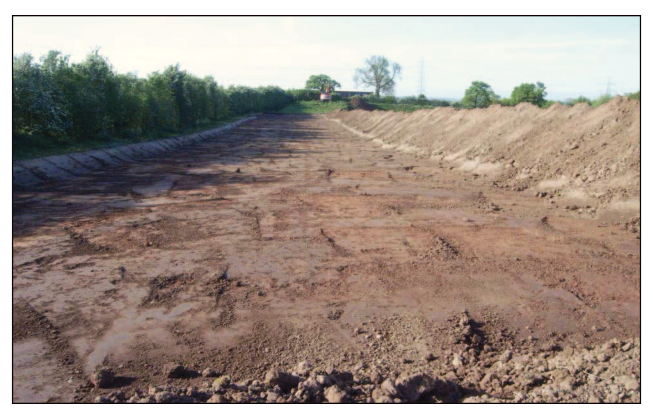
Plate 1: Topsoil strip for bund (looking south)