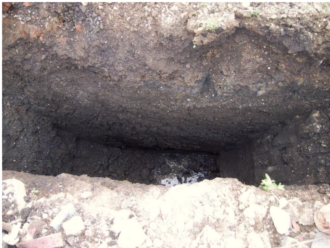
Plate 1 Test pit E showing undated, possibly archaeological fills