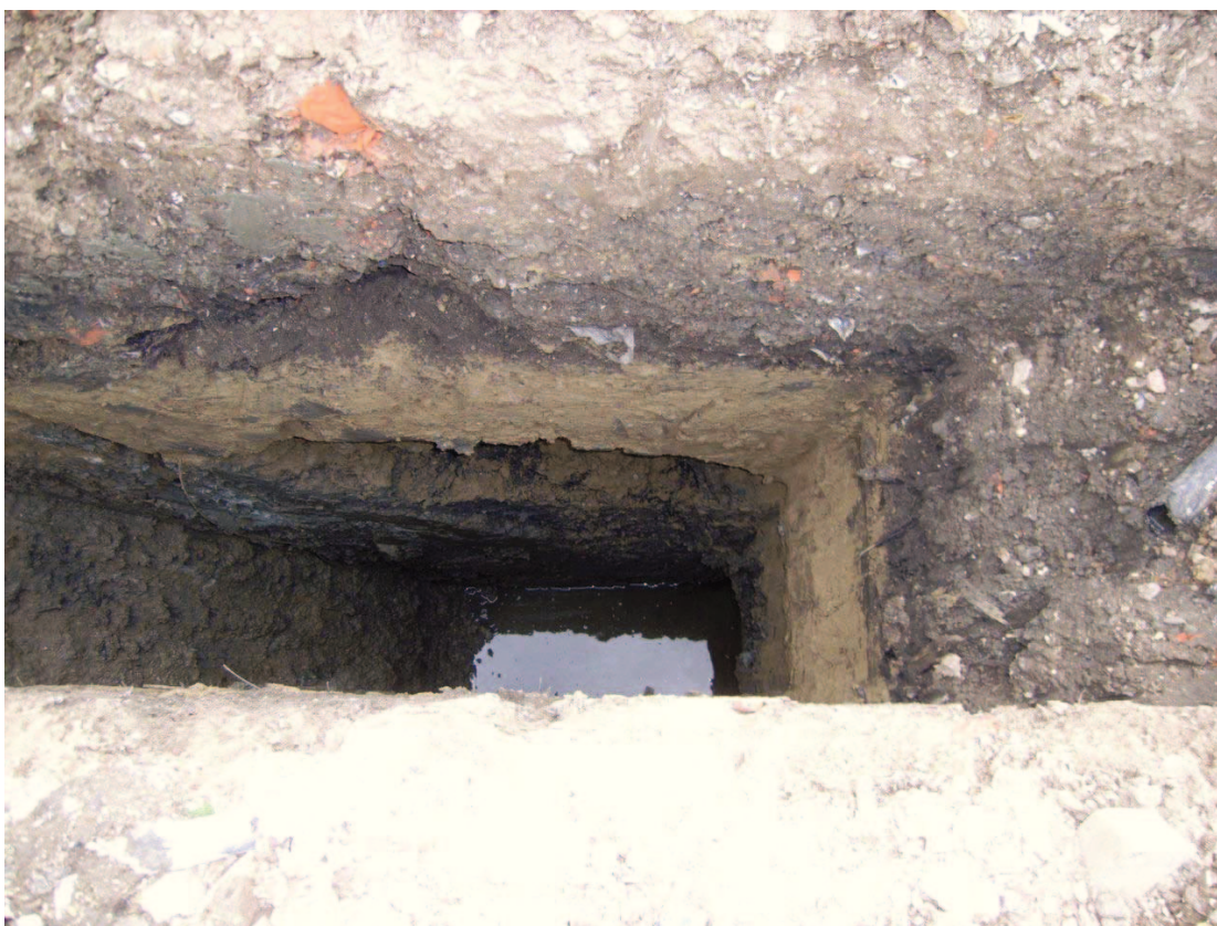
Plate 2 Test Pit I showing deep modern dumped deposits