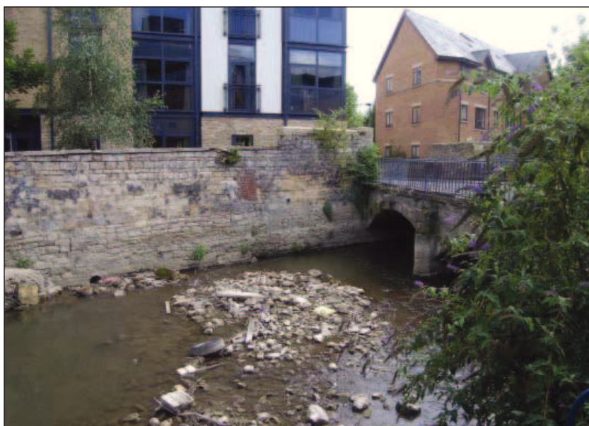
Plate 5: Revetment wall to south of current area