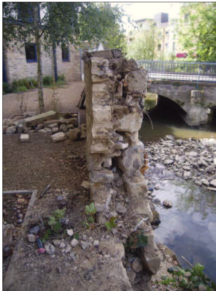
Plate 8: Core of wall during dismantling (south side)