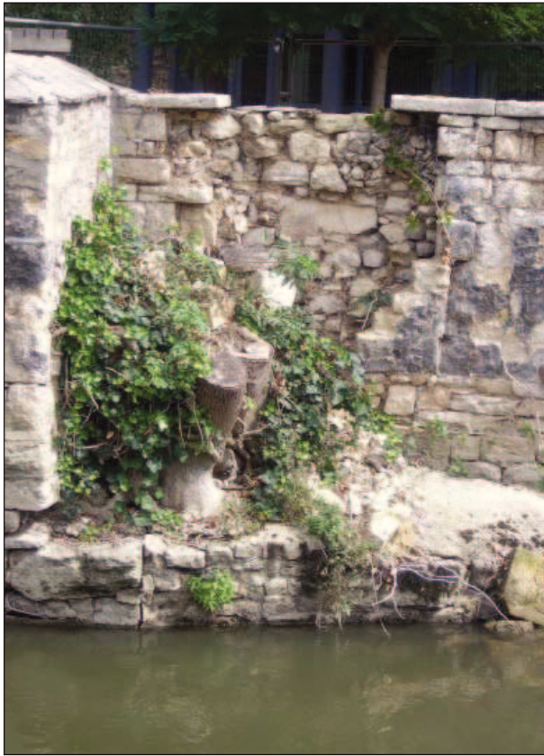
Plate 6: View of area collapse prior to conservation