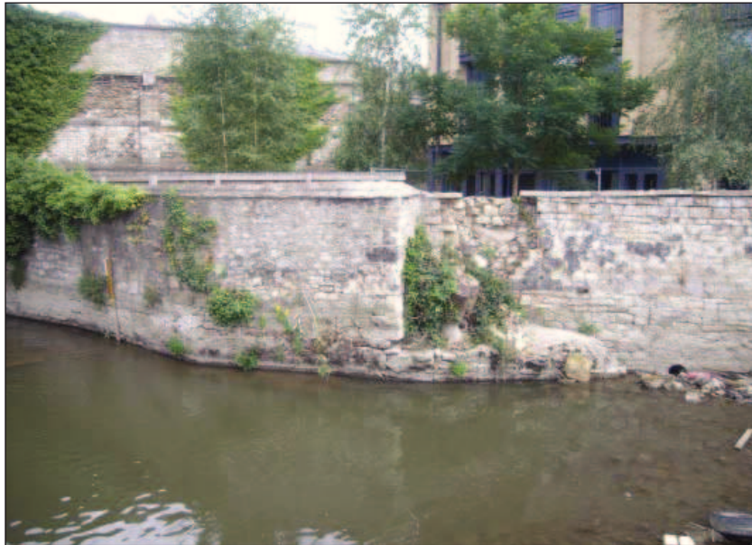
Plate 3: General view of wall prior to start of conservation works