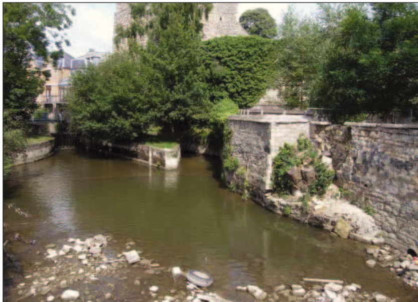
Plate 4: General view of wall from south with St George's Tower in background