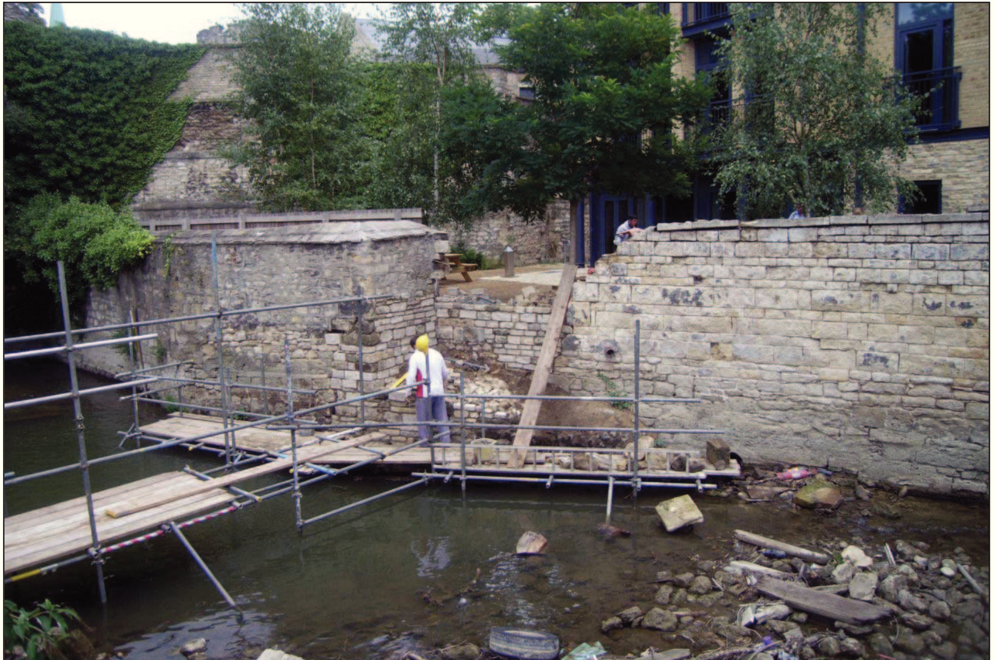
Plate 1: Repair work underway