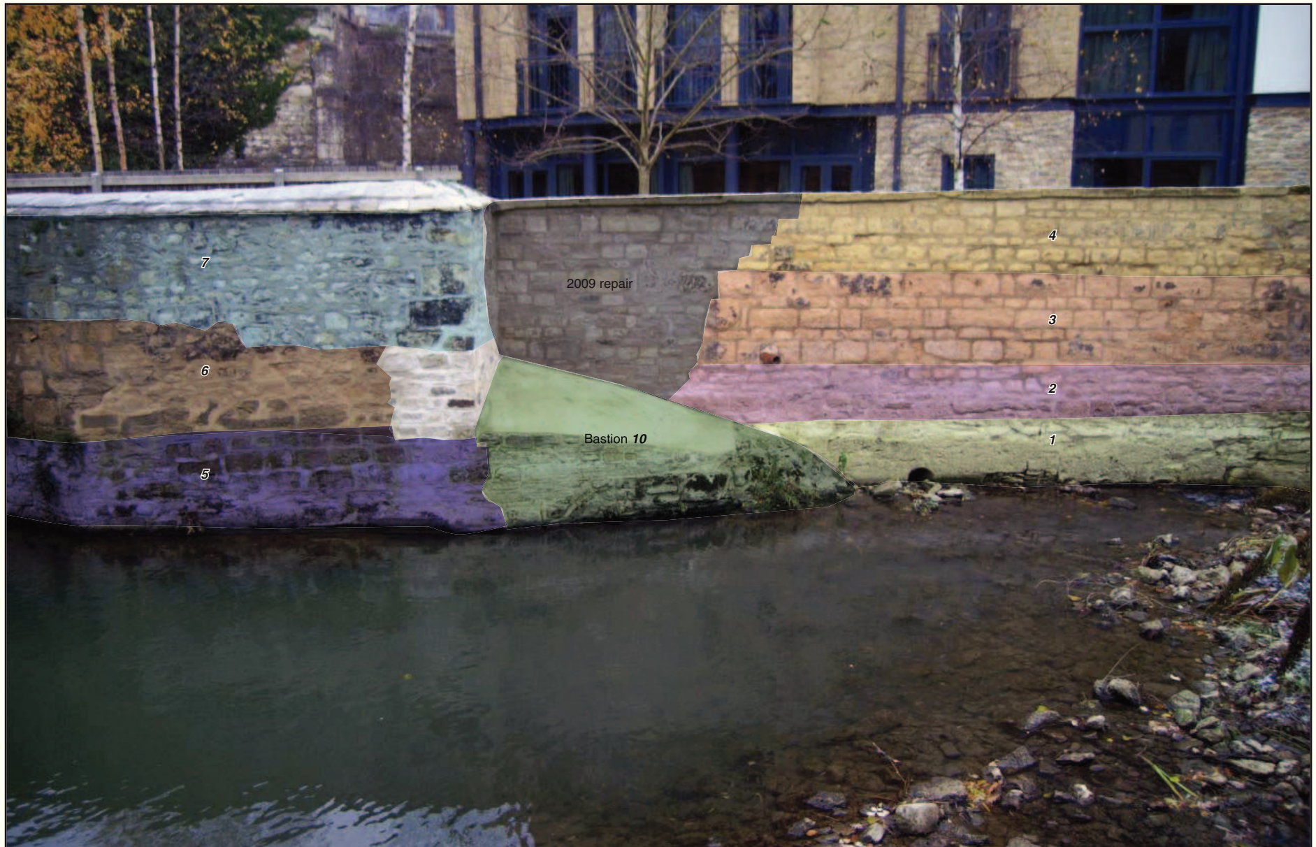
Plate 2: Phases of work within wall