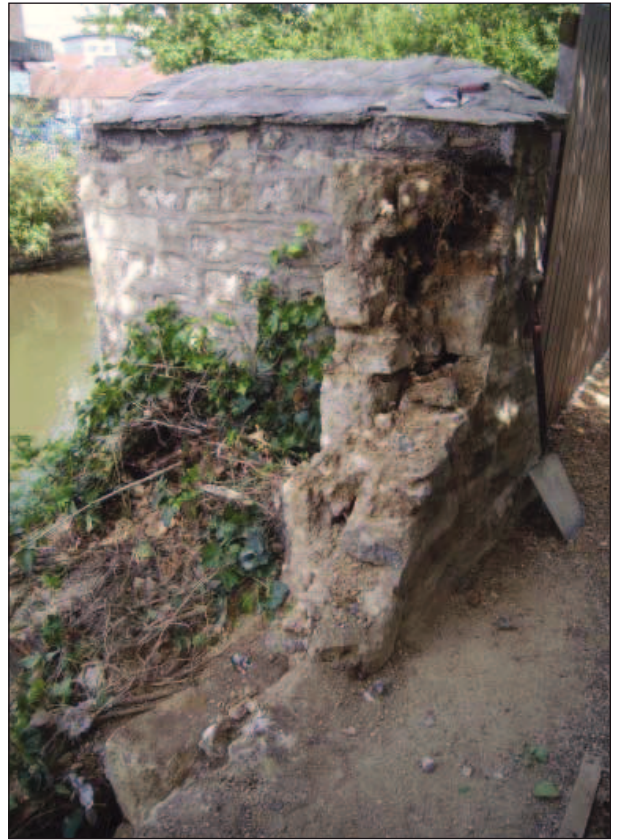
Plate 7: Core of wall during dismantling (north side)