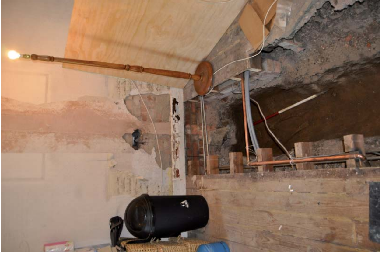
Plate 2: View of trench looking north-west