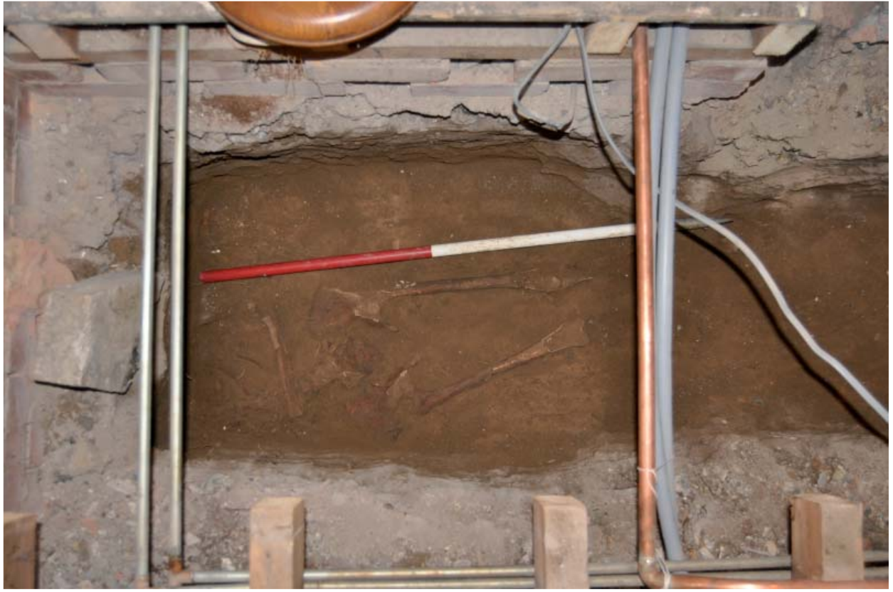
Plate 1: Skeleton 1