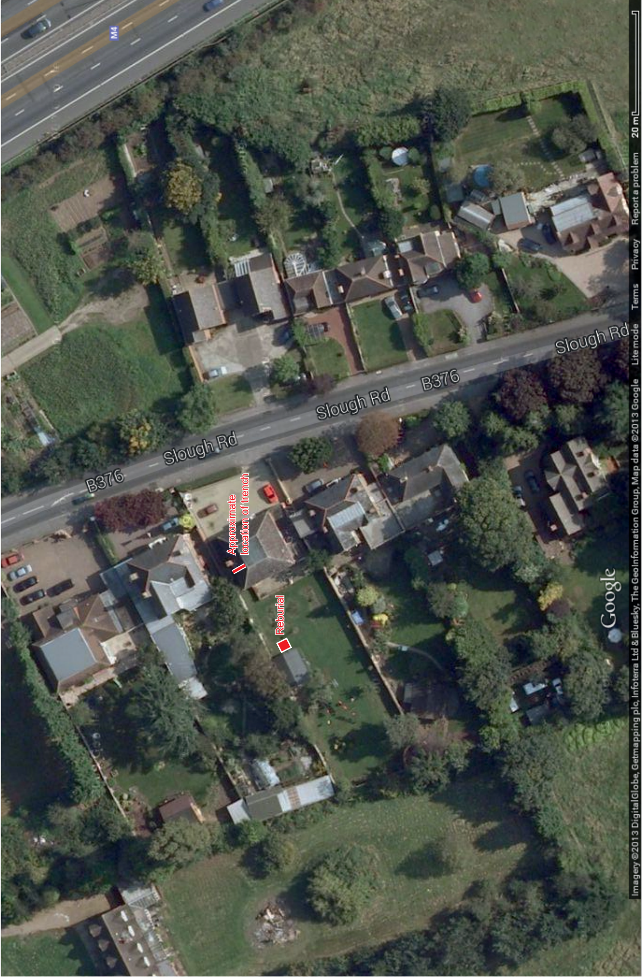
Figure 3: Location of reburial