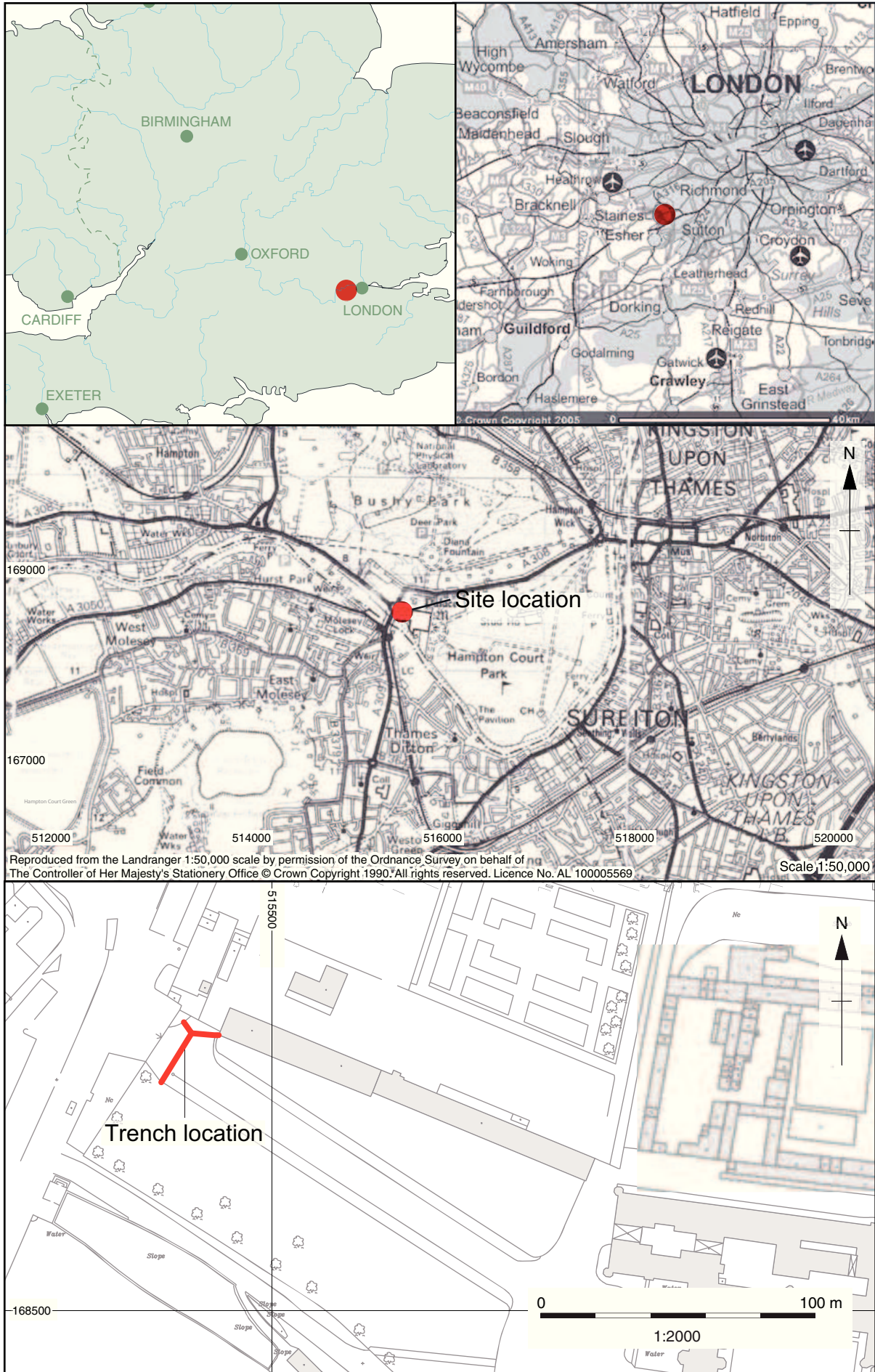
Figure 1: Site location