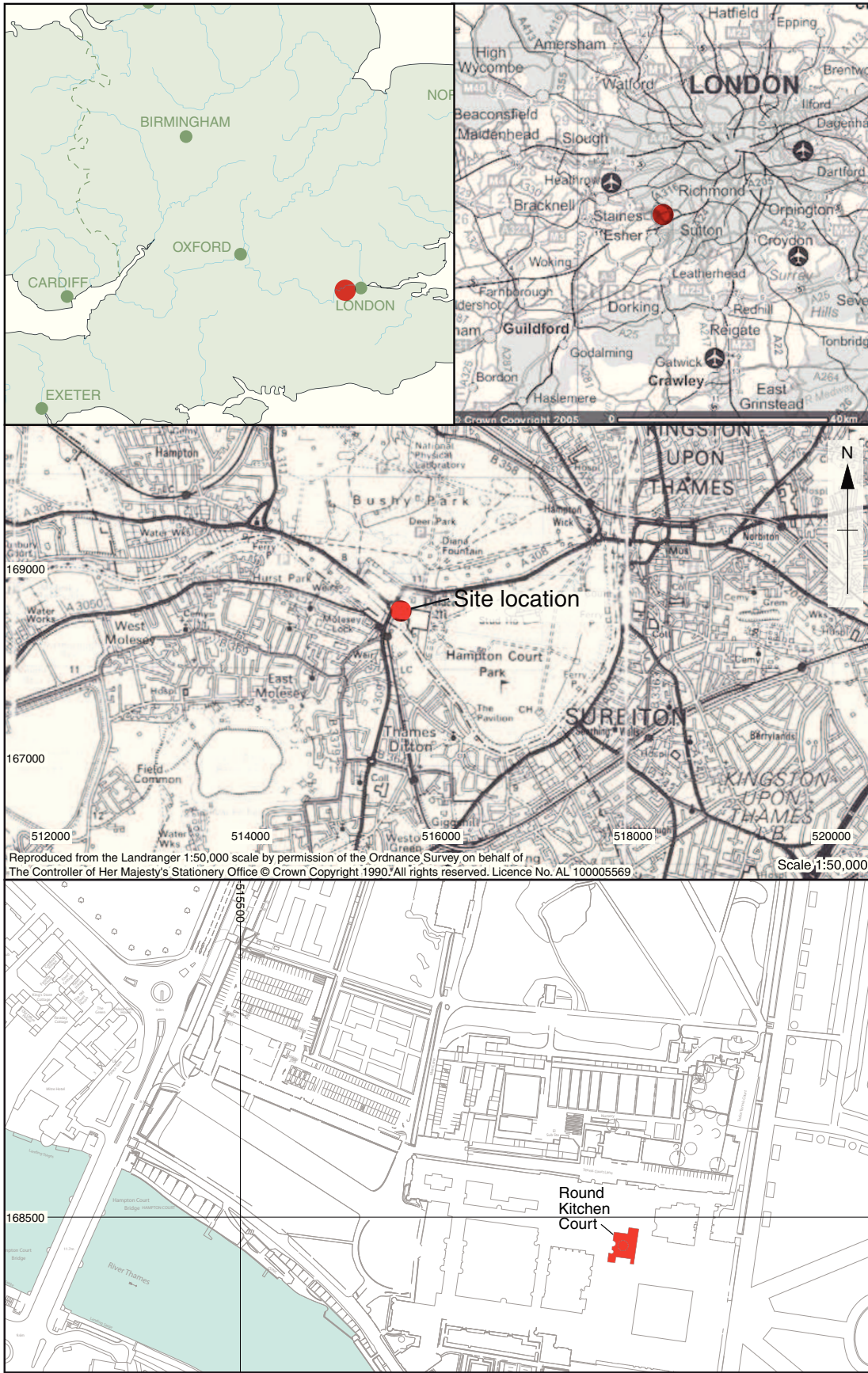
Figure 1: Site location