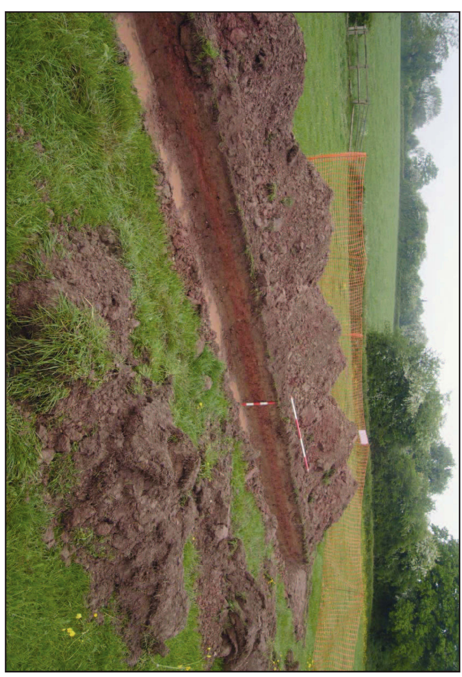
Plate 5: Trench 6, redeposited layer 601, looking north-west