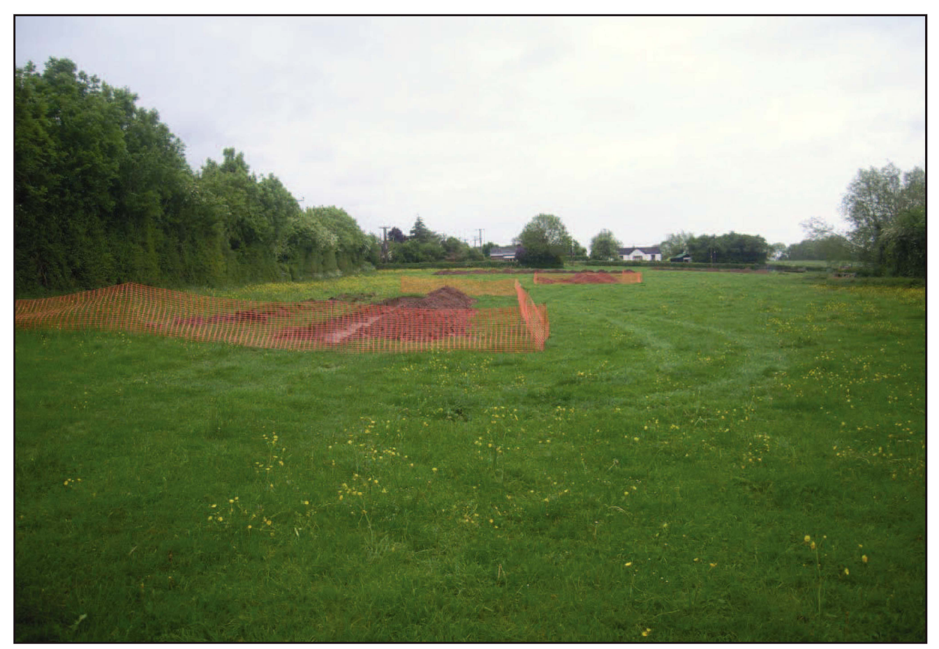
Plate 3: Western field with trenches excavated, looking south