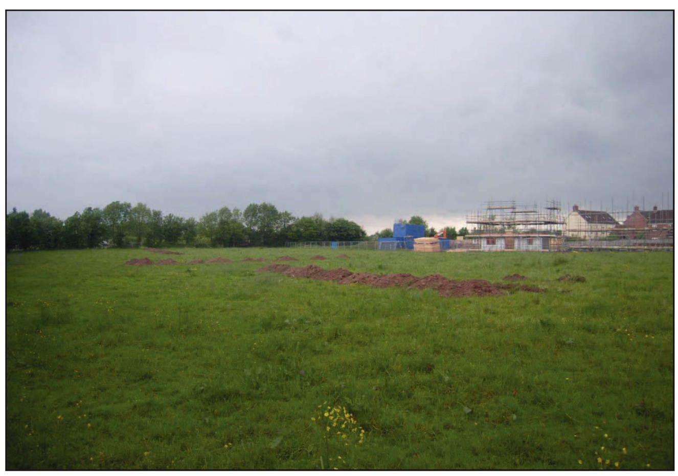
Plate 2: Eastern field with trenches excavated looking north-east