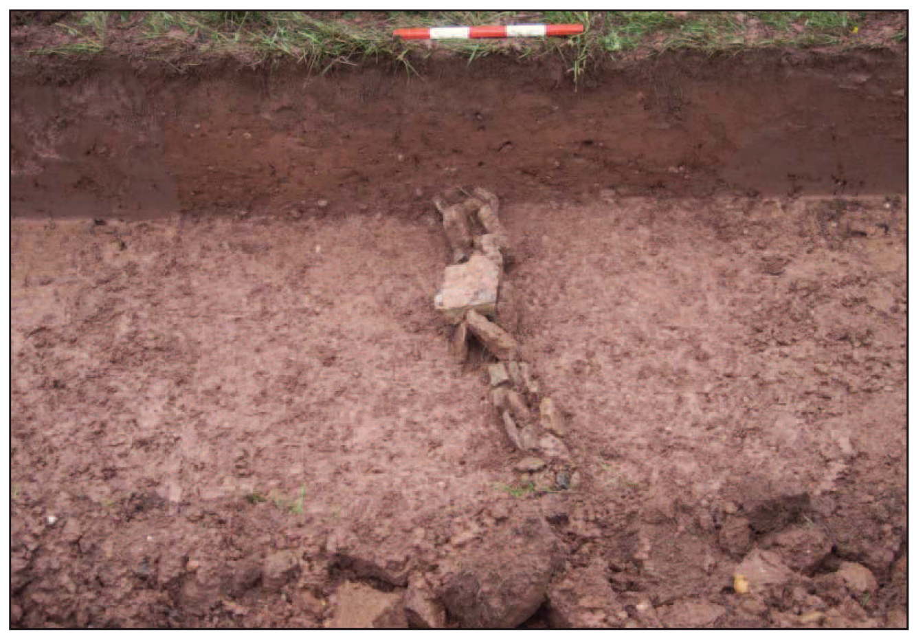
Plate 4: Trench 5, field drain 502, looking east