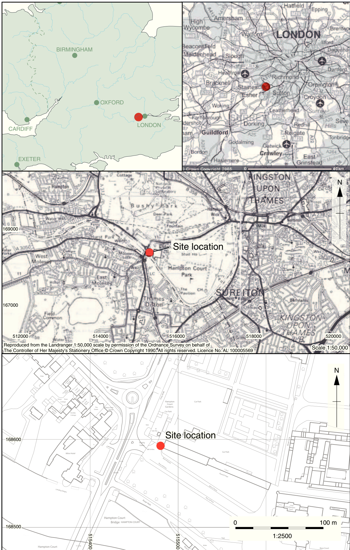
Figure 1: Site location